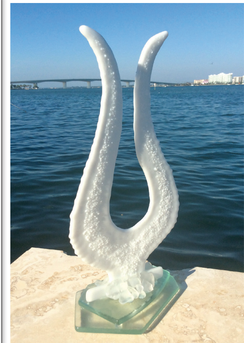
1 Circle, by Esther Jensen of Art Uptown.