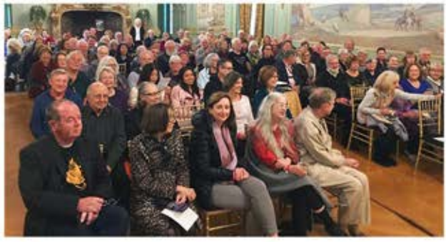
Filoli Historic Trust - March 2019

Les Utopiales Festival de Science-Fiction - Nantes, France