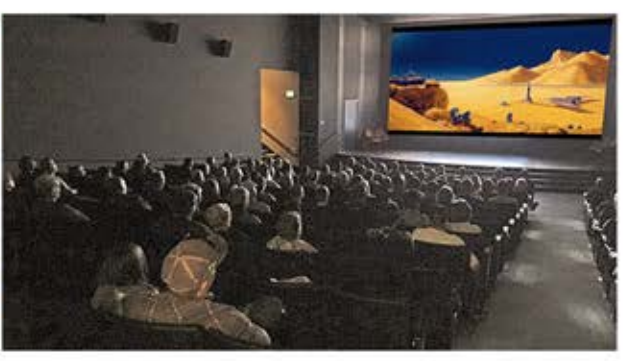
Seattle Museum of Flight - August 2019