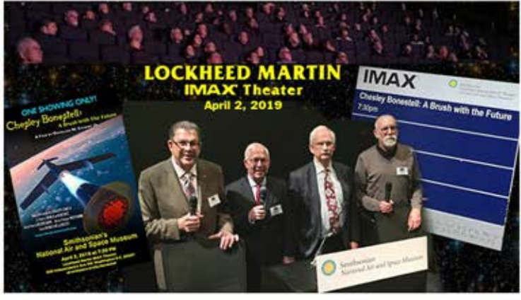
Smithsonian National Air and Space Museum - April 2019