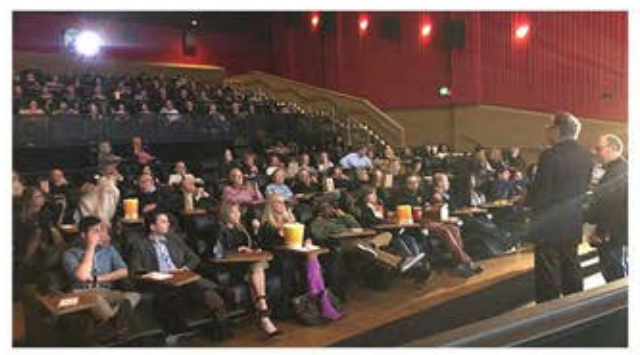
Newport Beach Film Festival - May 2018