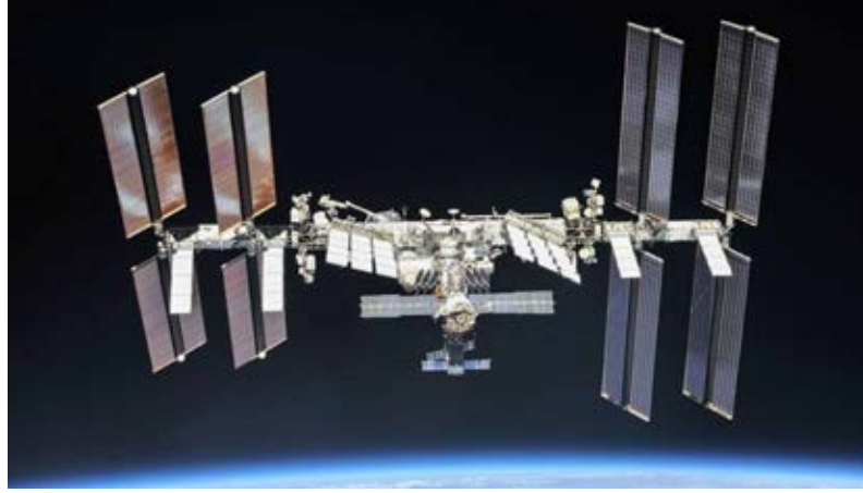
The International Space Station