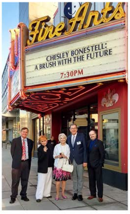
Ahrya Fine Arts Theatre - August 2019