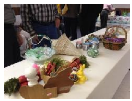
The show 'n tell table.

The show 'n tell at the September meeting featured creamers, soup bowls, and cup and saucers and the alternative uses club members have for their items.