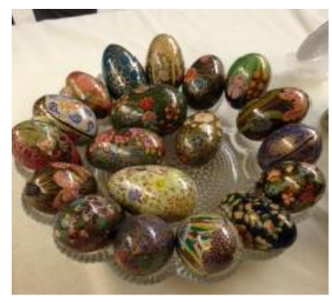
Elizabeth Furlong brought handed painted eggs from all over...