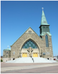
Saint Augustine's 340 Dominion Street Moncton, NB

November 19th 2017 Thirty-Third Sunday in Ordinary Time