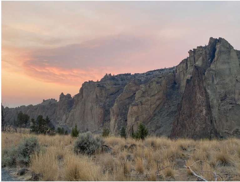
Selinda Smith's trip to Central/Eastern Oregon

Song You Raise Me Up Mormon Tabernacle Choir