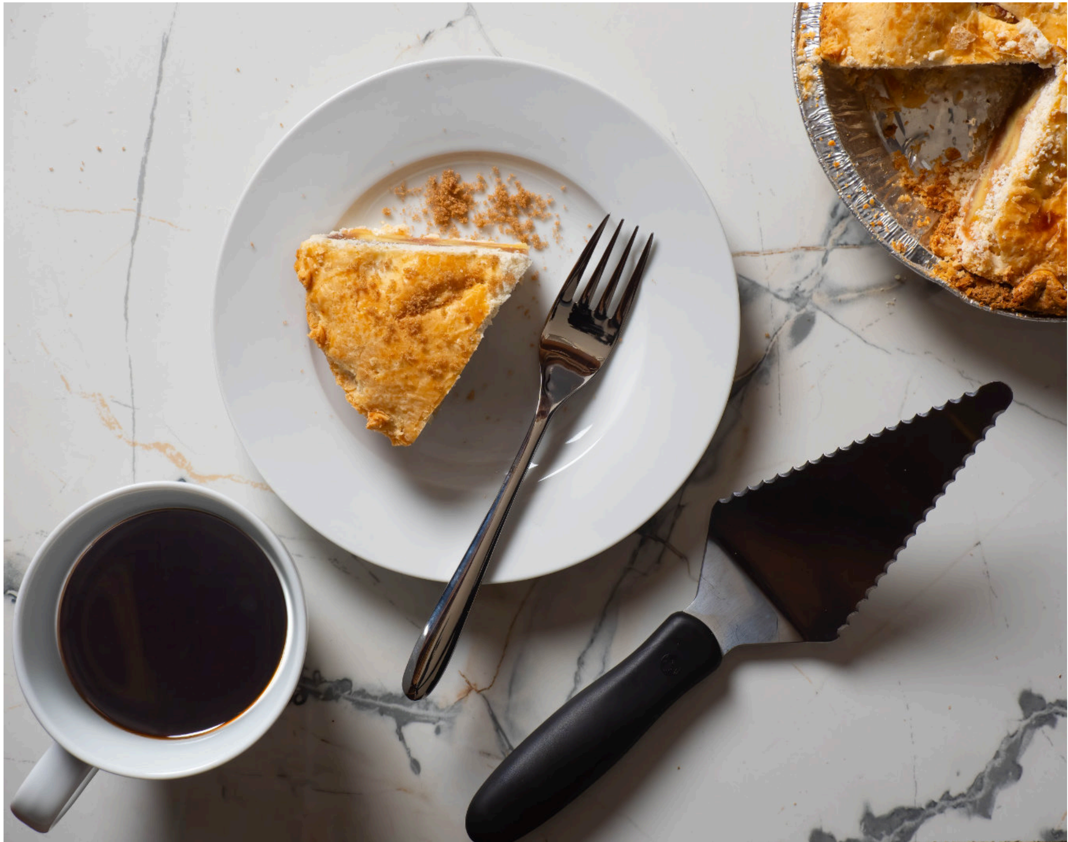
Entry - 21