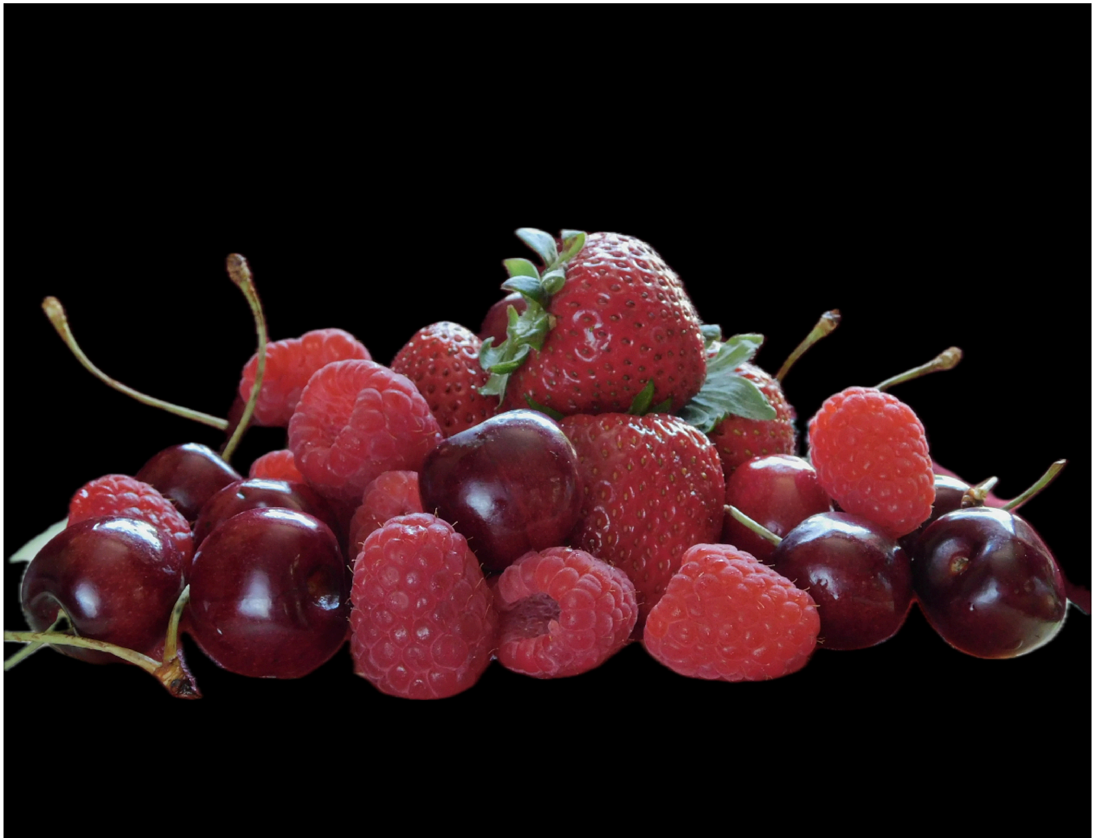
Entry - 19