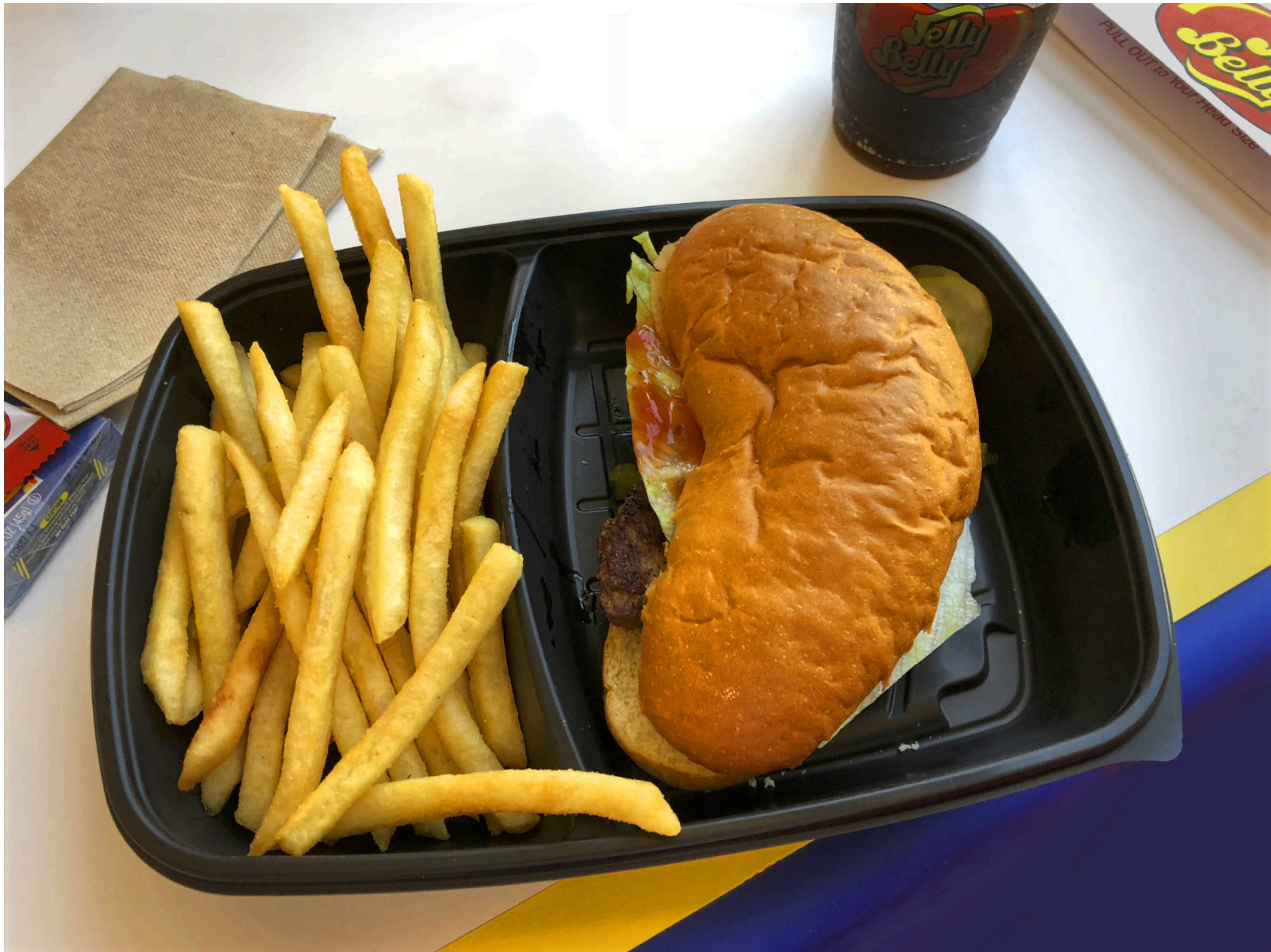
Entry - 14