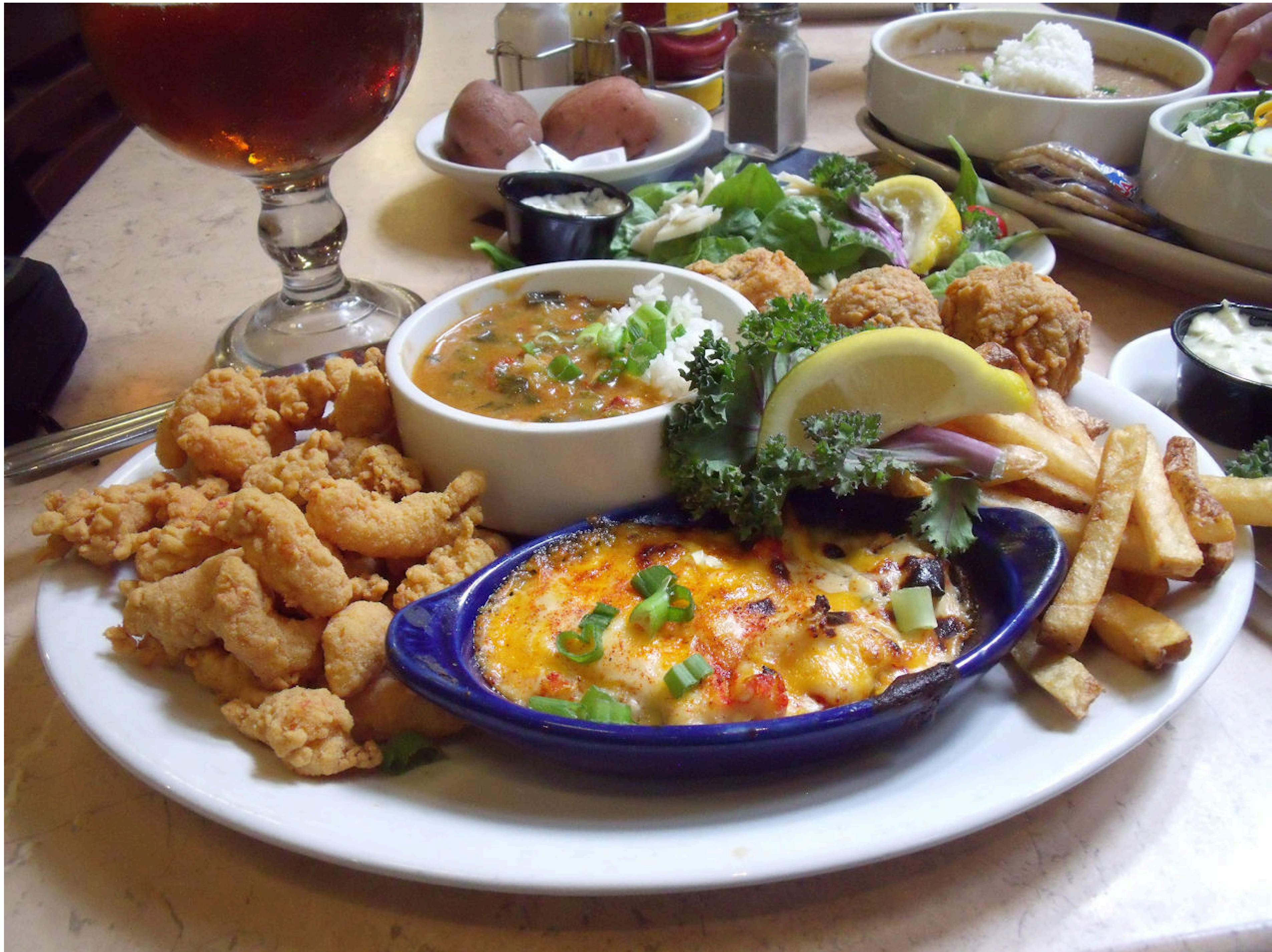
Entry - 16