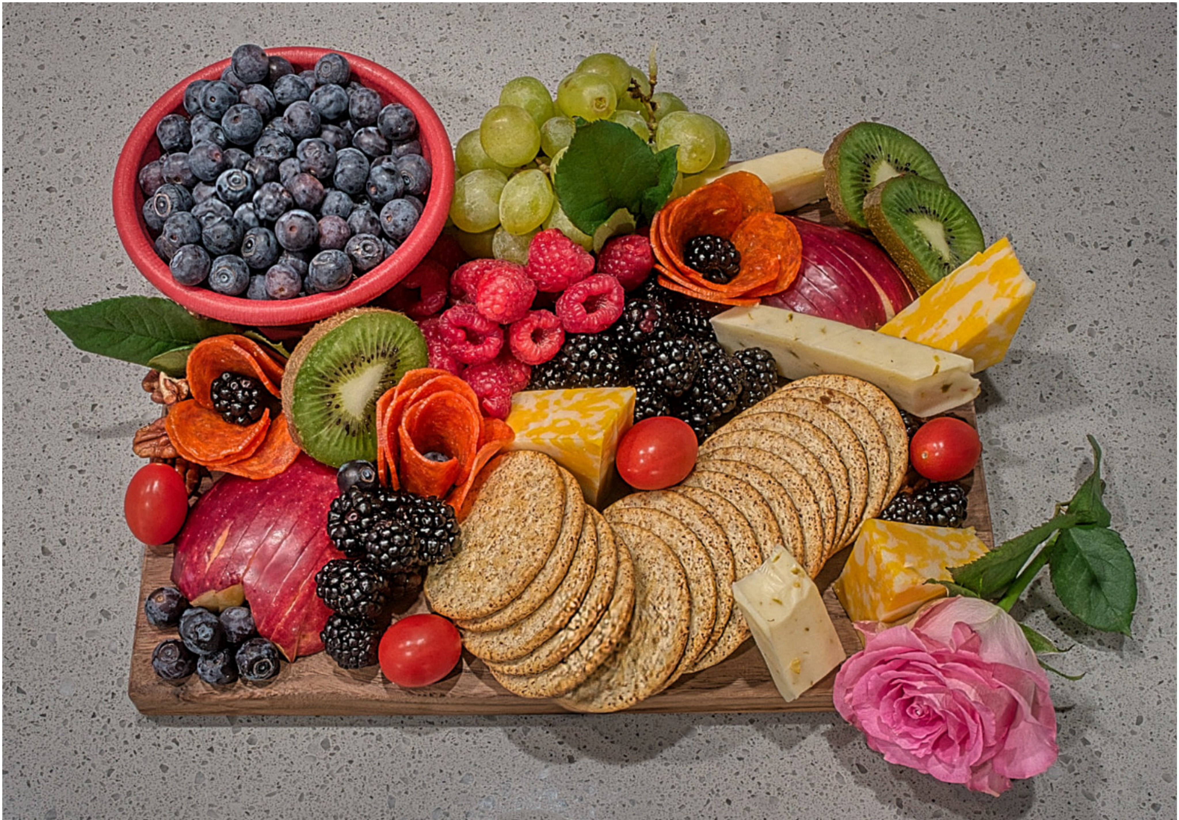
Entry - 5