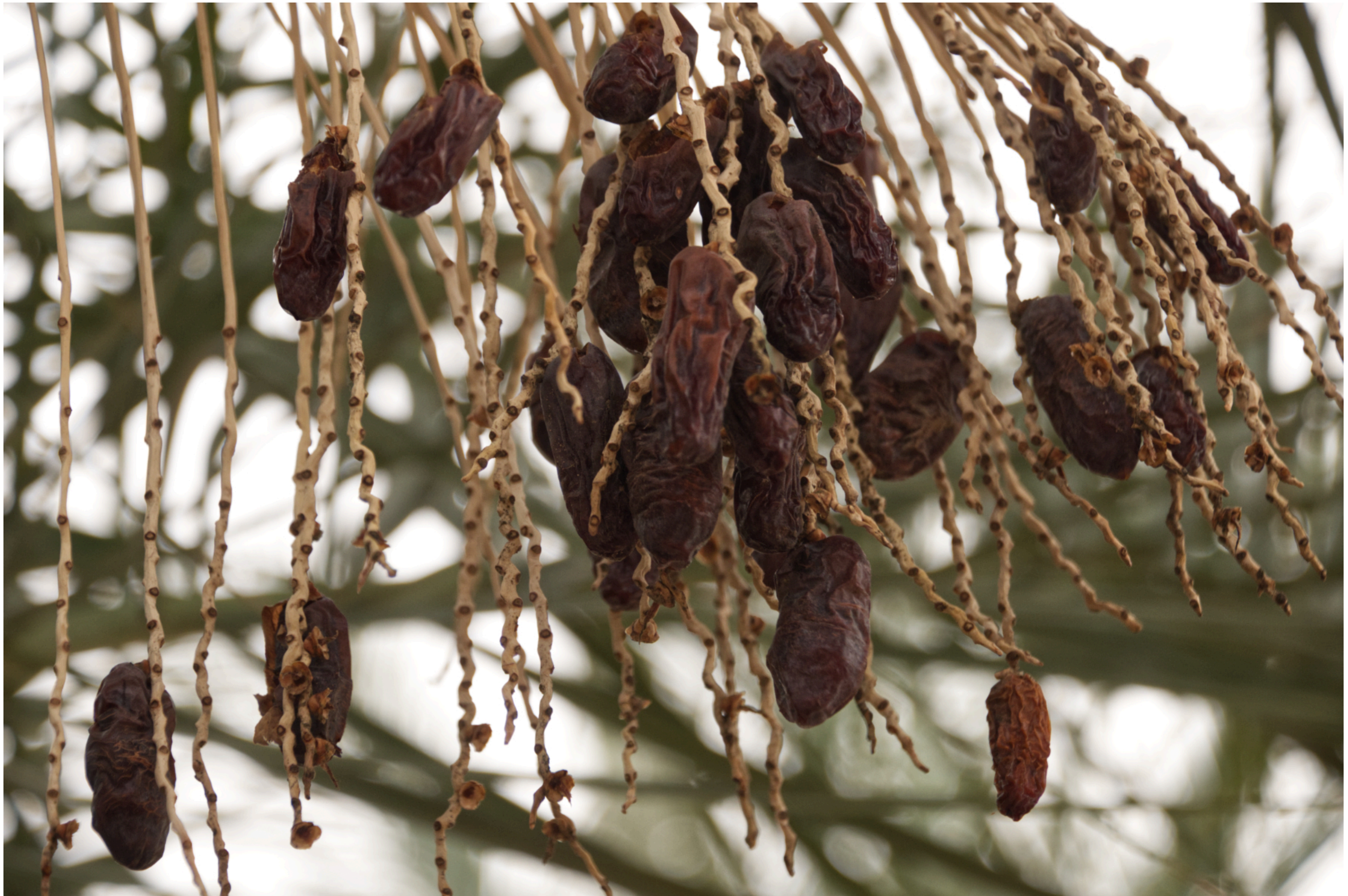
Entry - 10