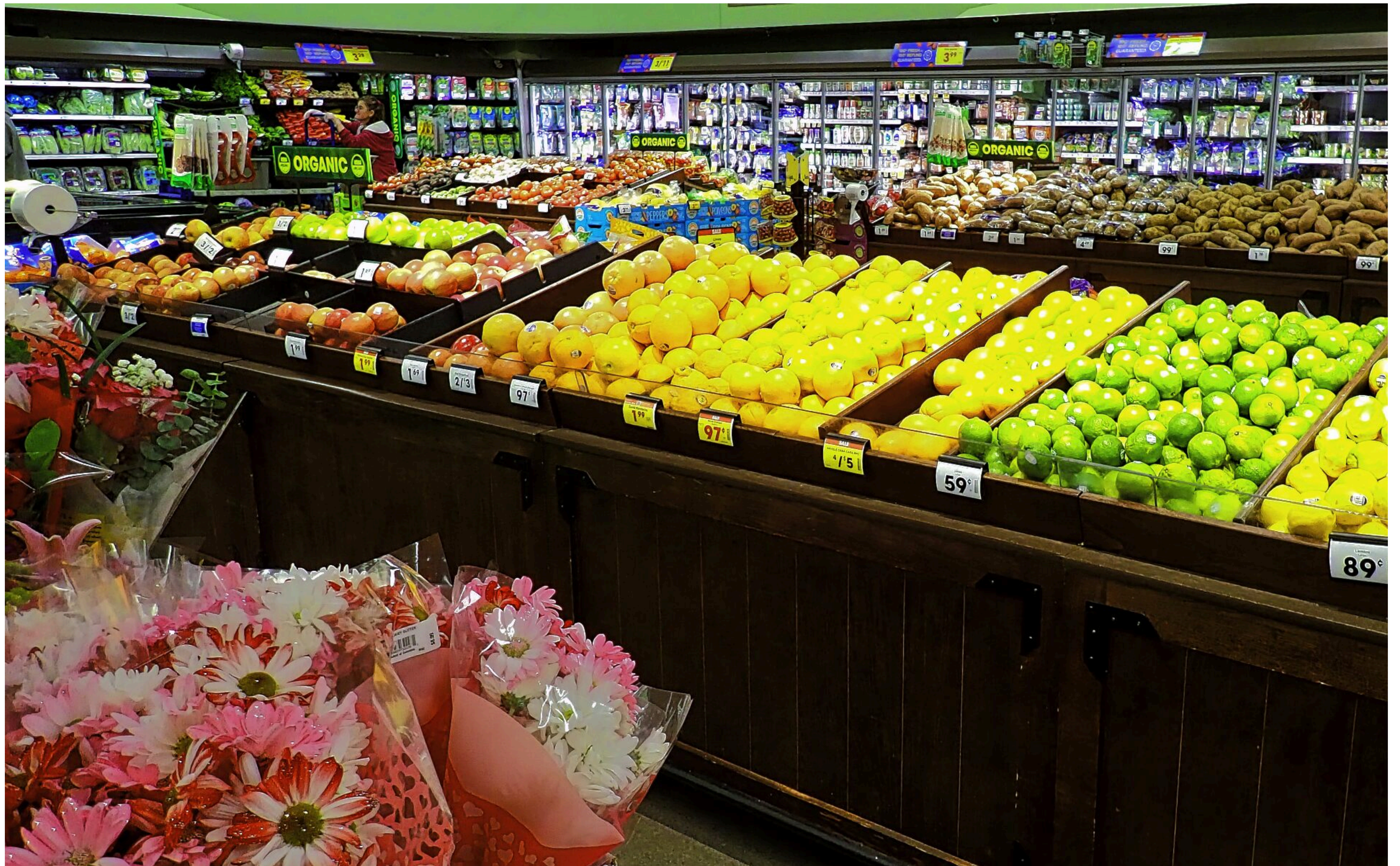
Entry - 13