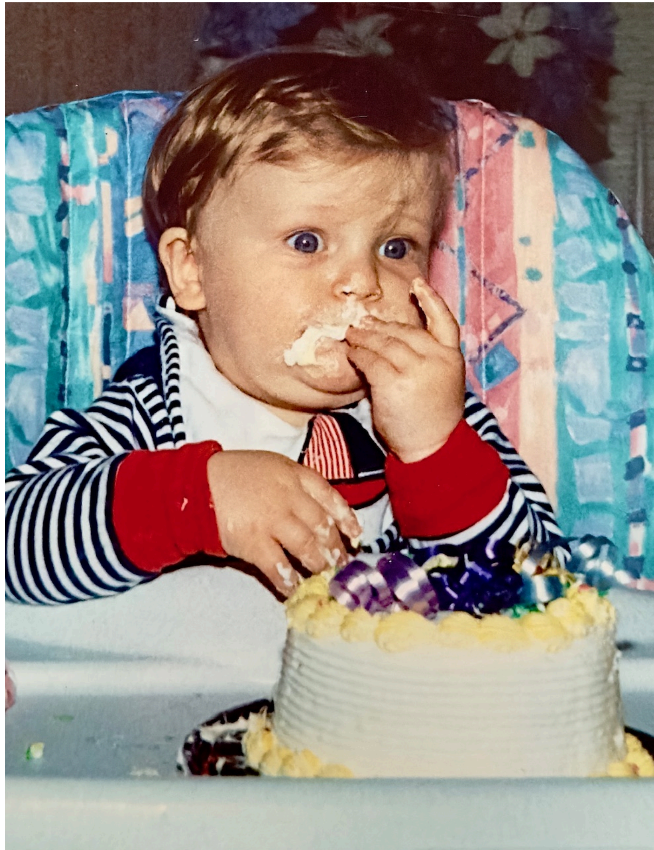
Entry - 6