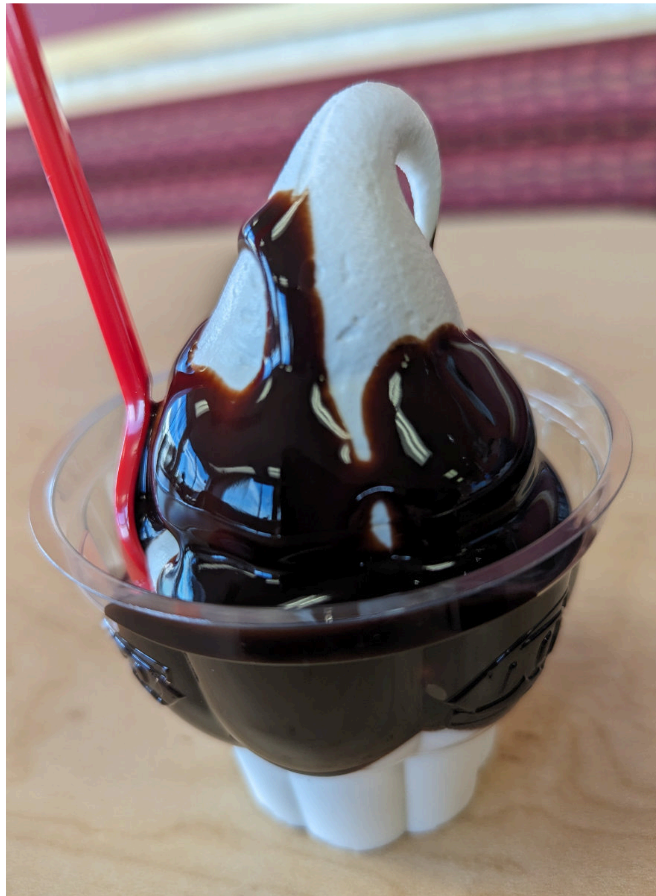
Entry - 20