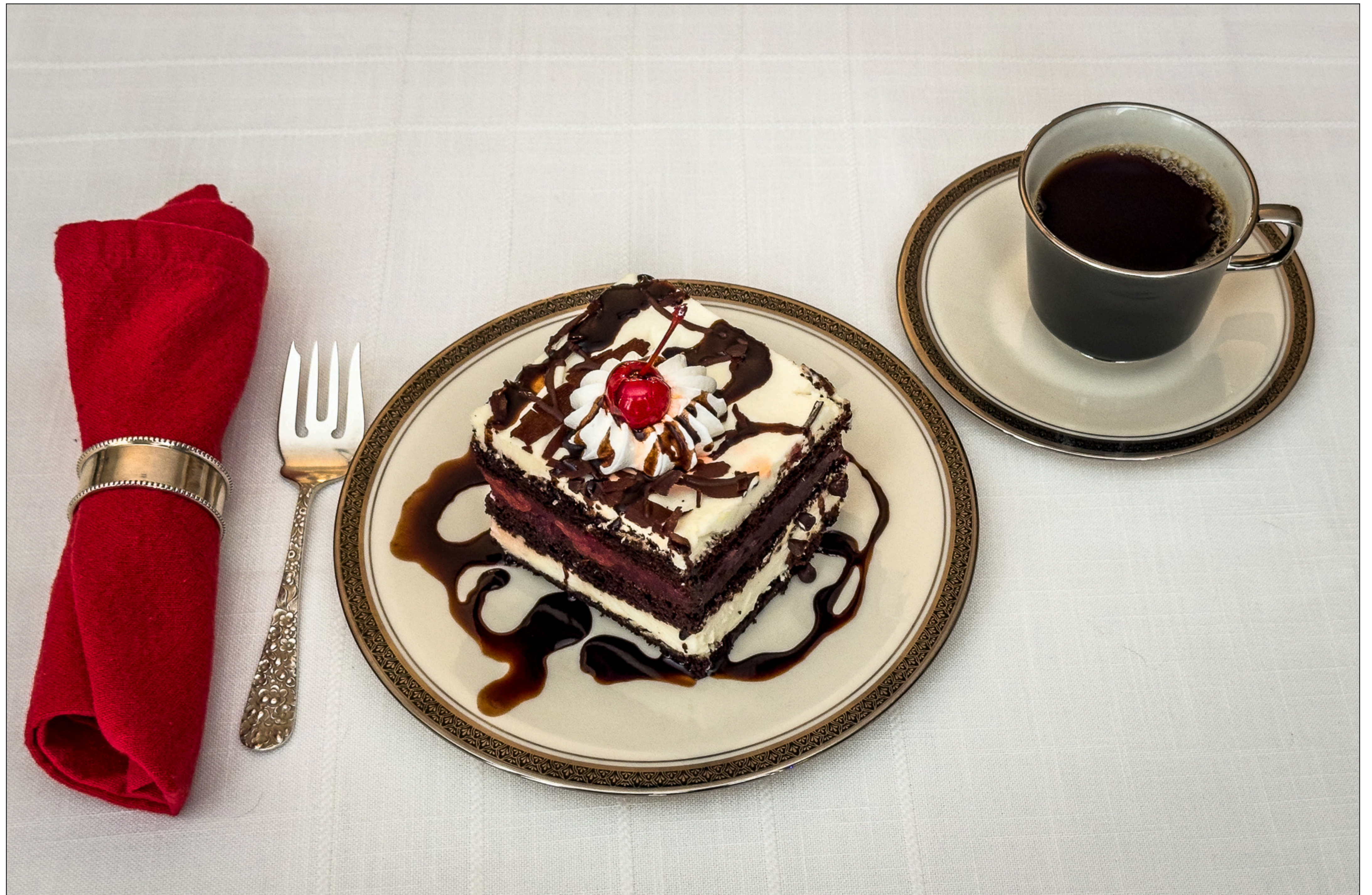
Entry - 18