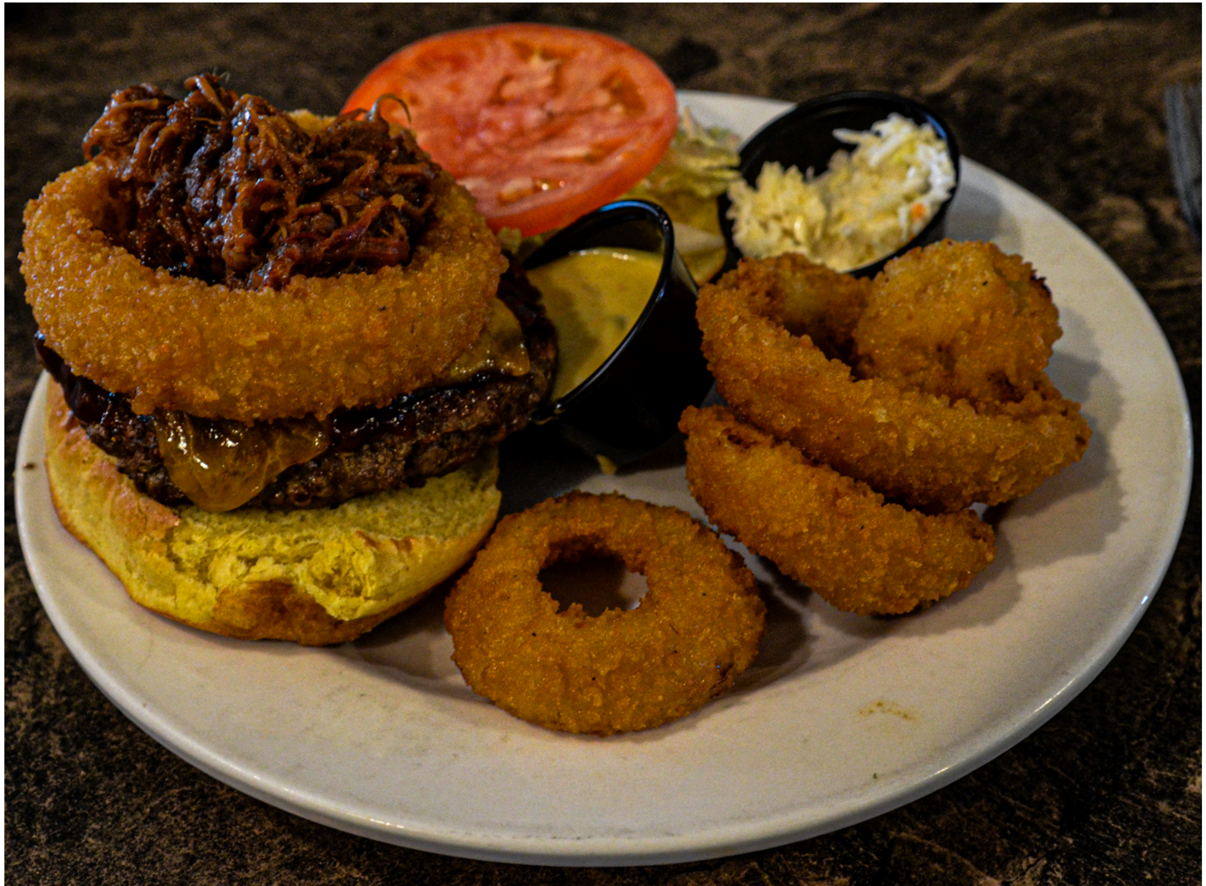
Entry - 1