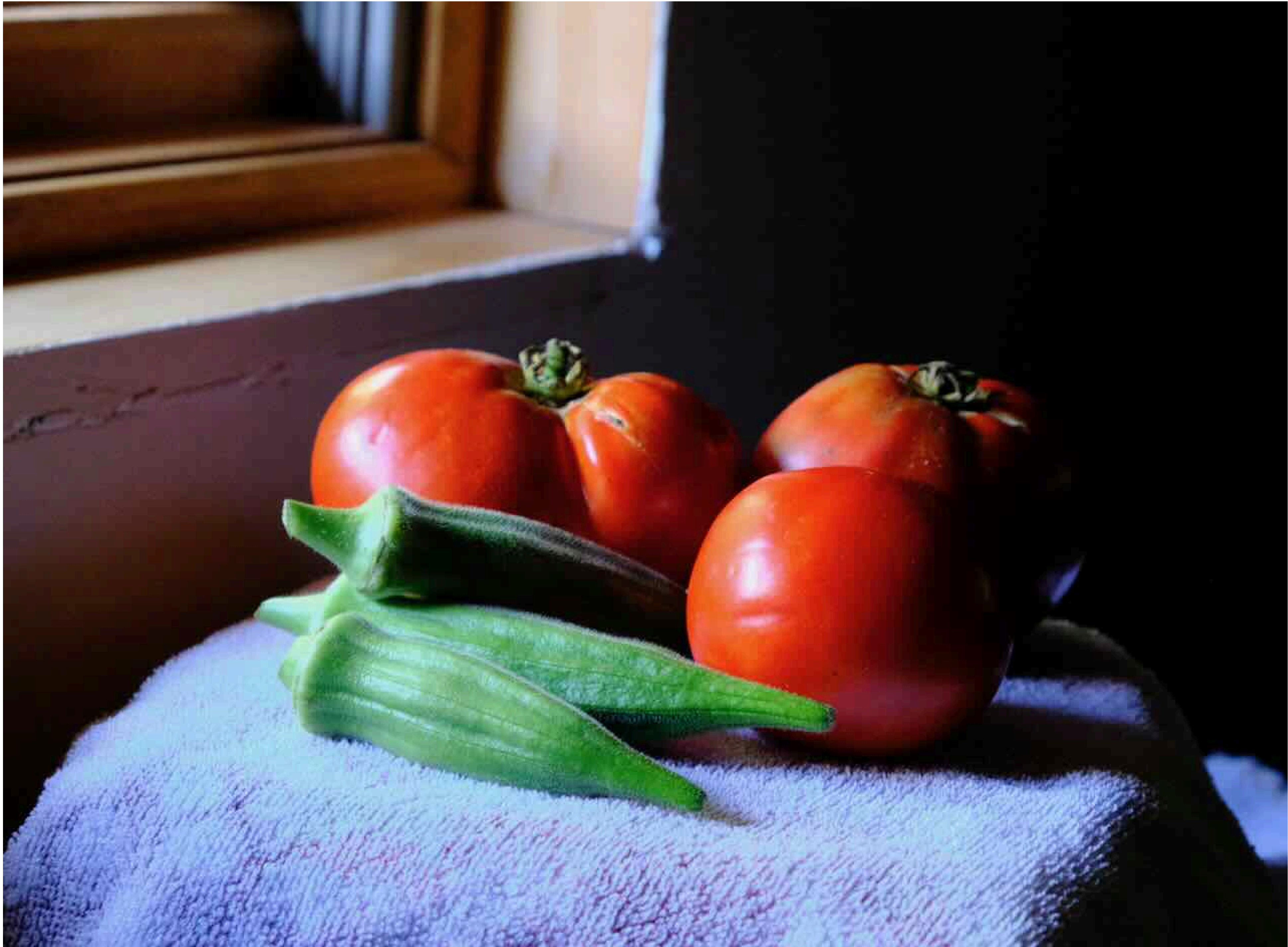
Entry - 3