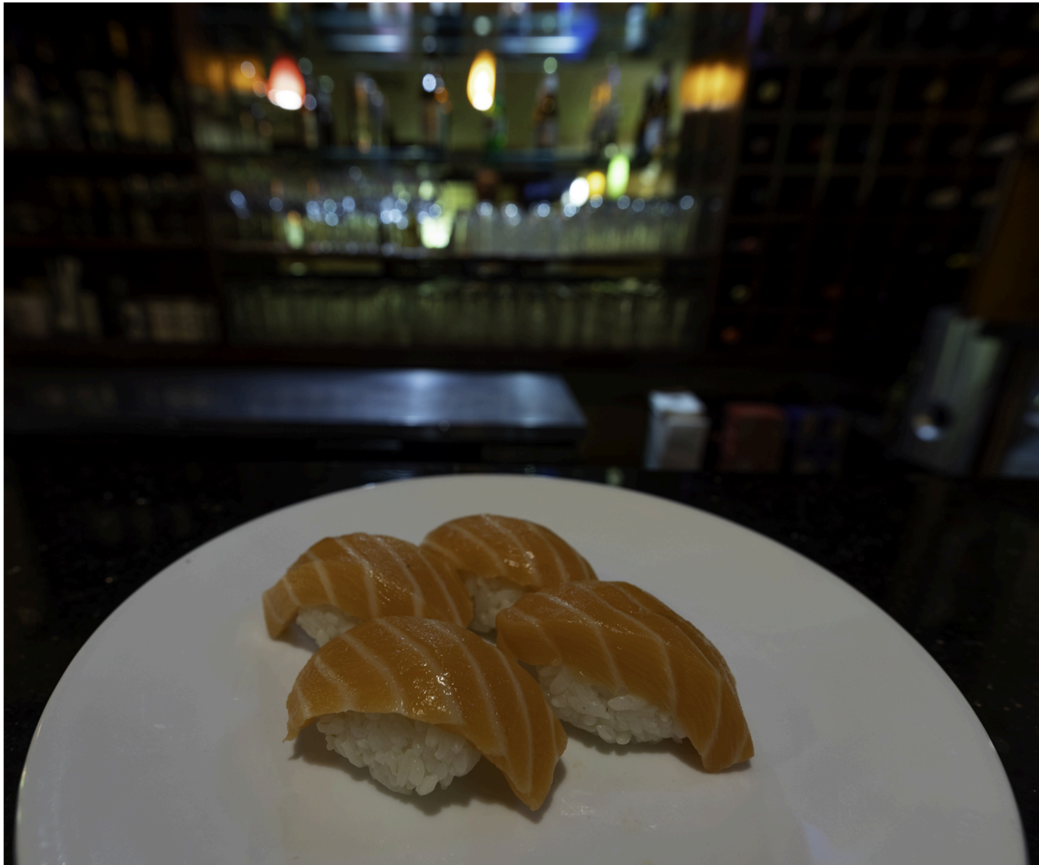
Entry - 12