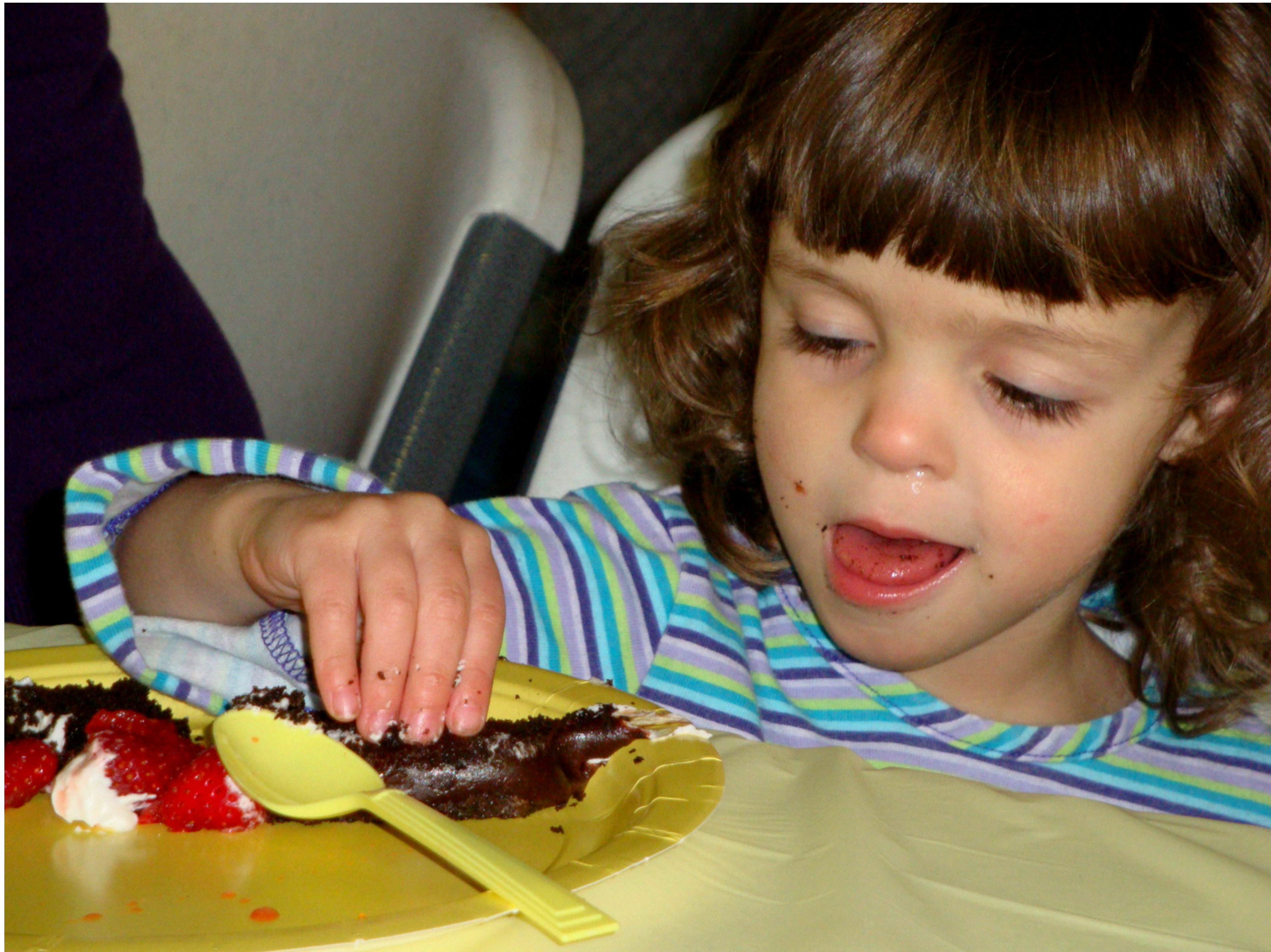
Entry - 15