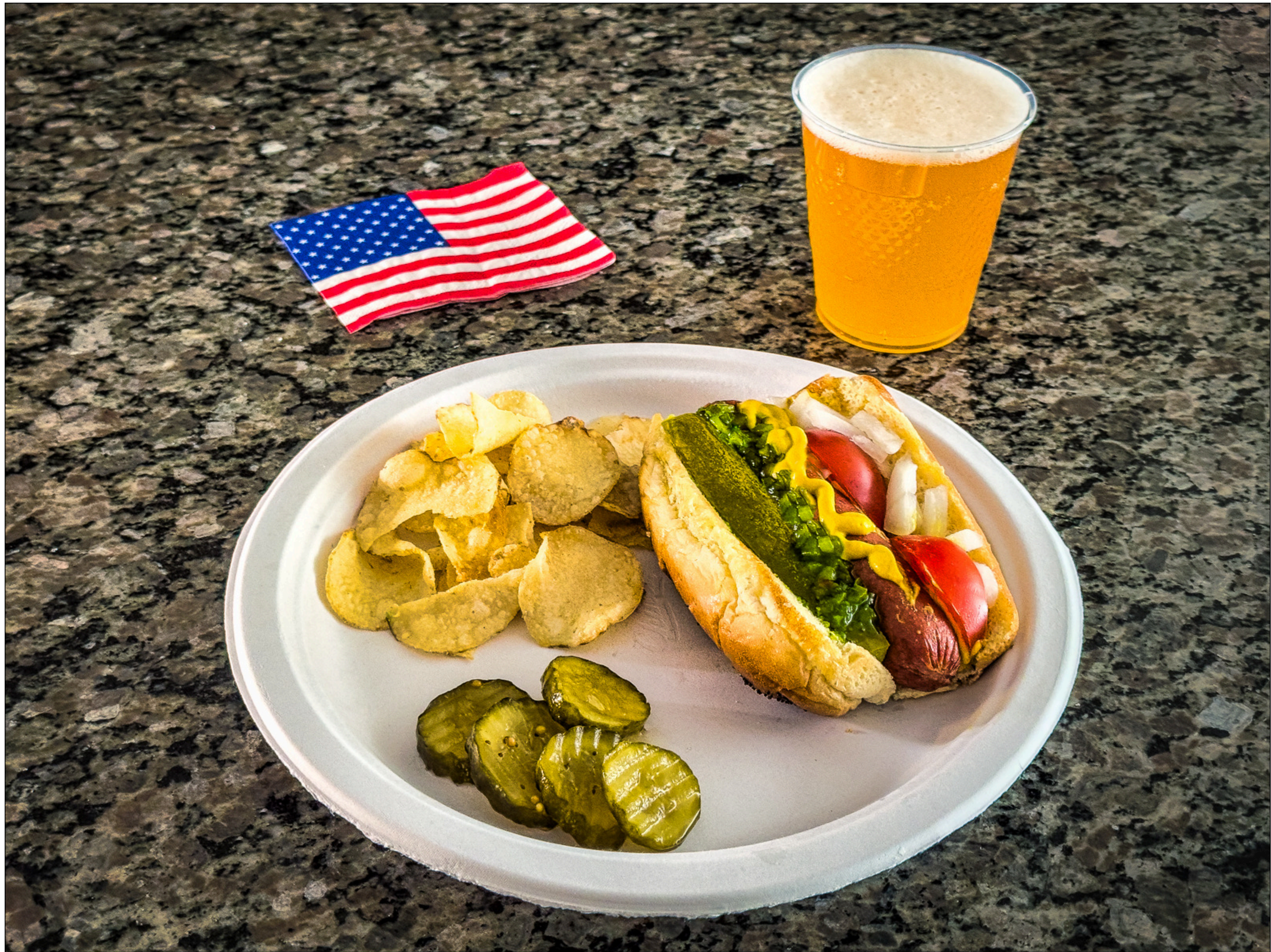
Entry - 2