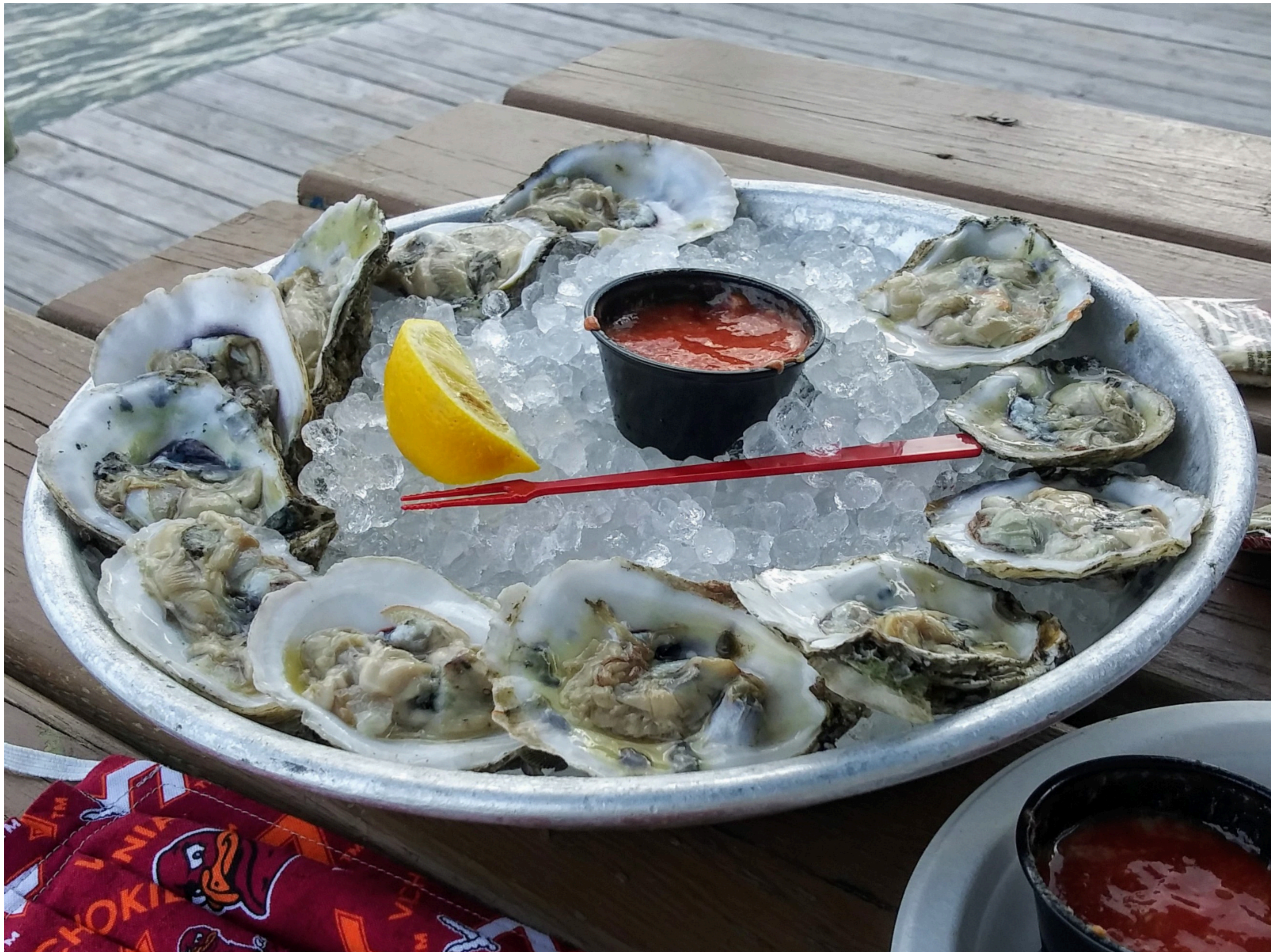
Entry - 7