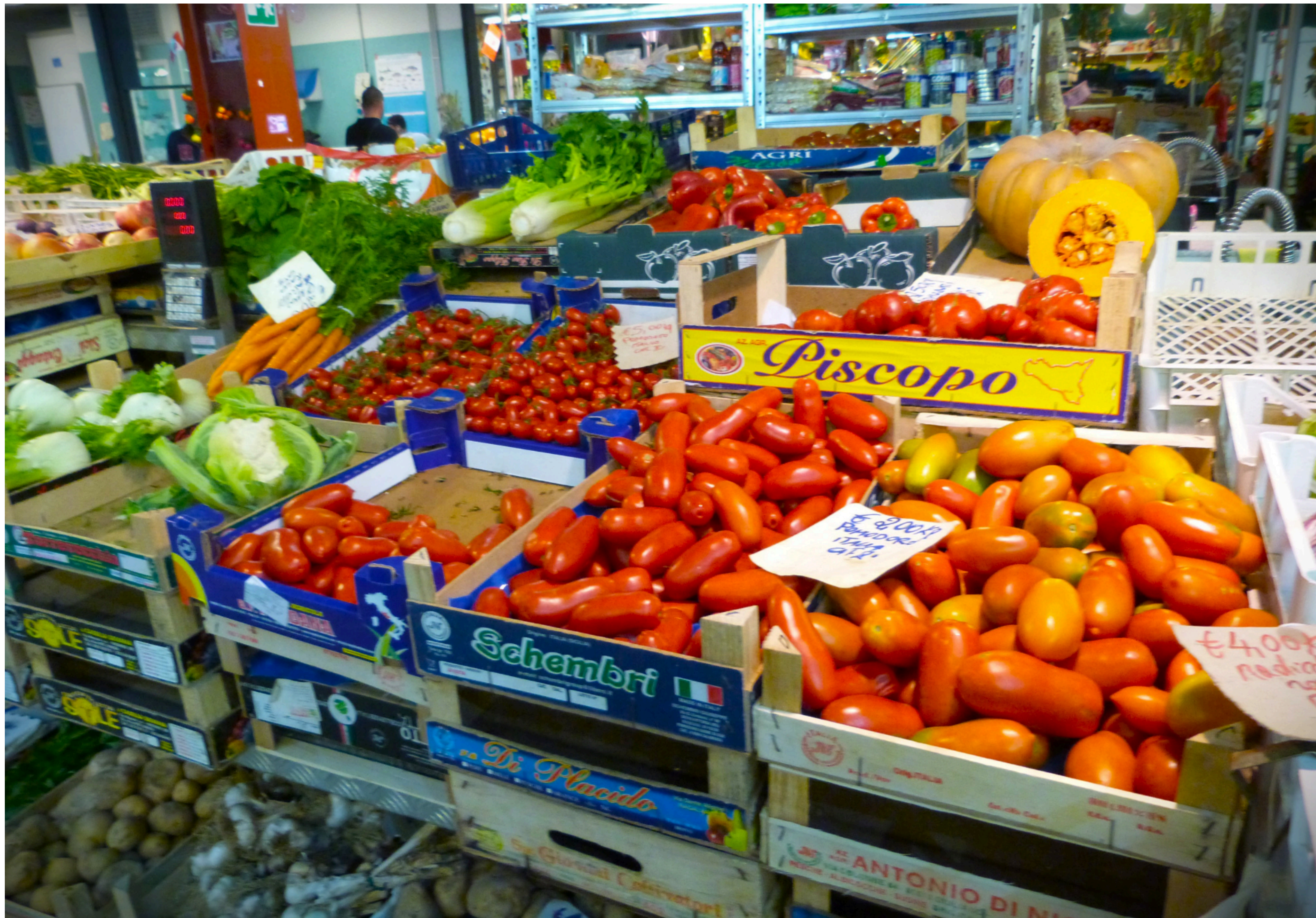
Entry - 17