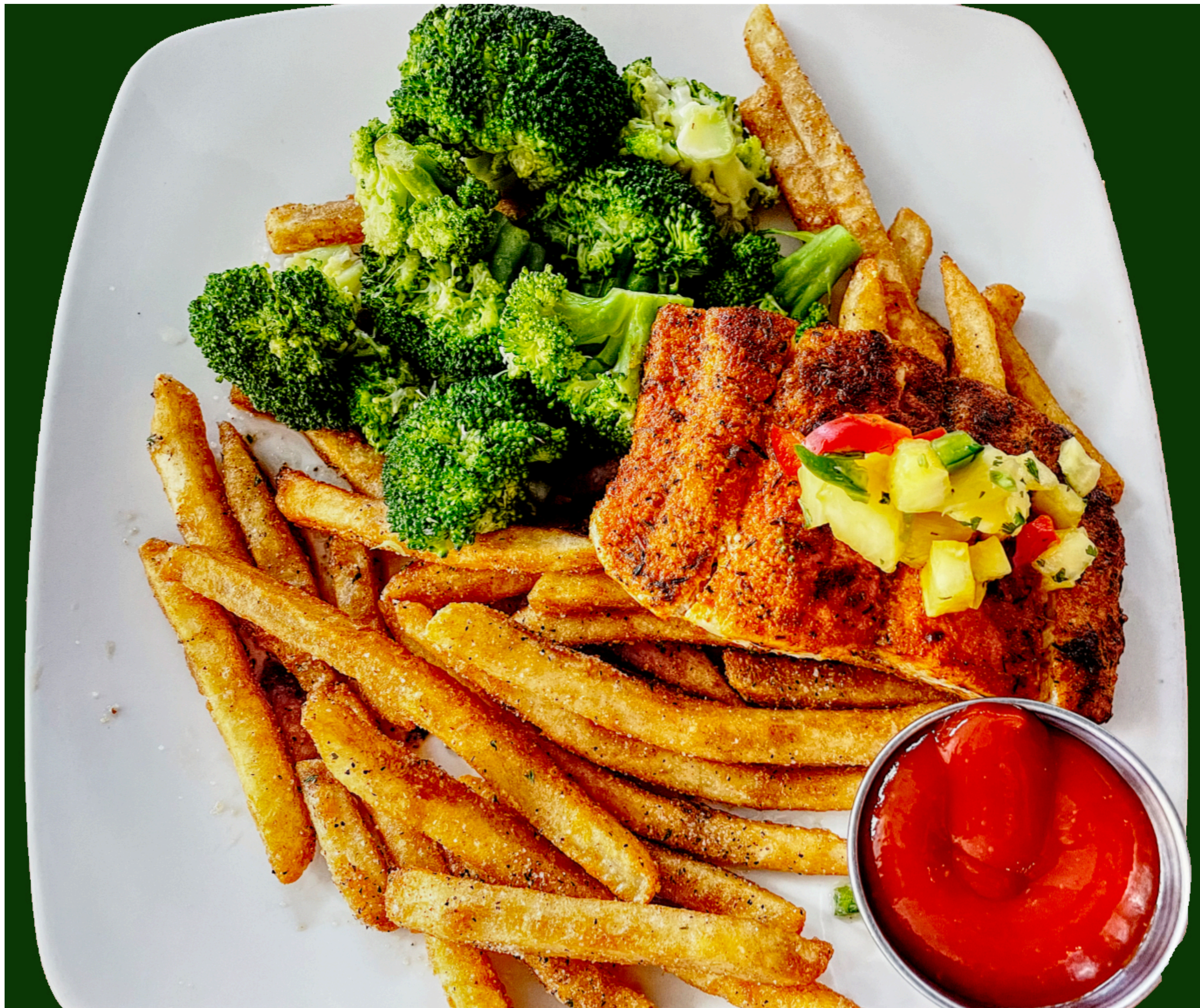
Entry - 9