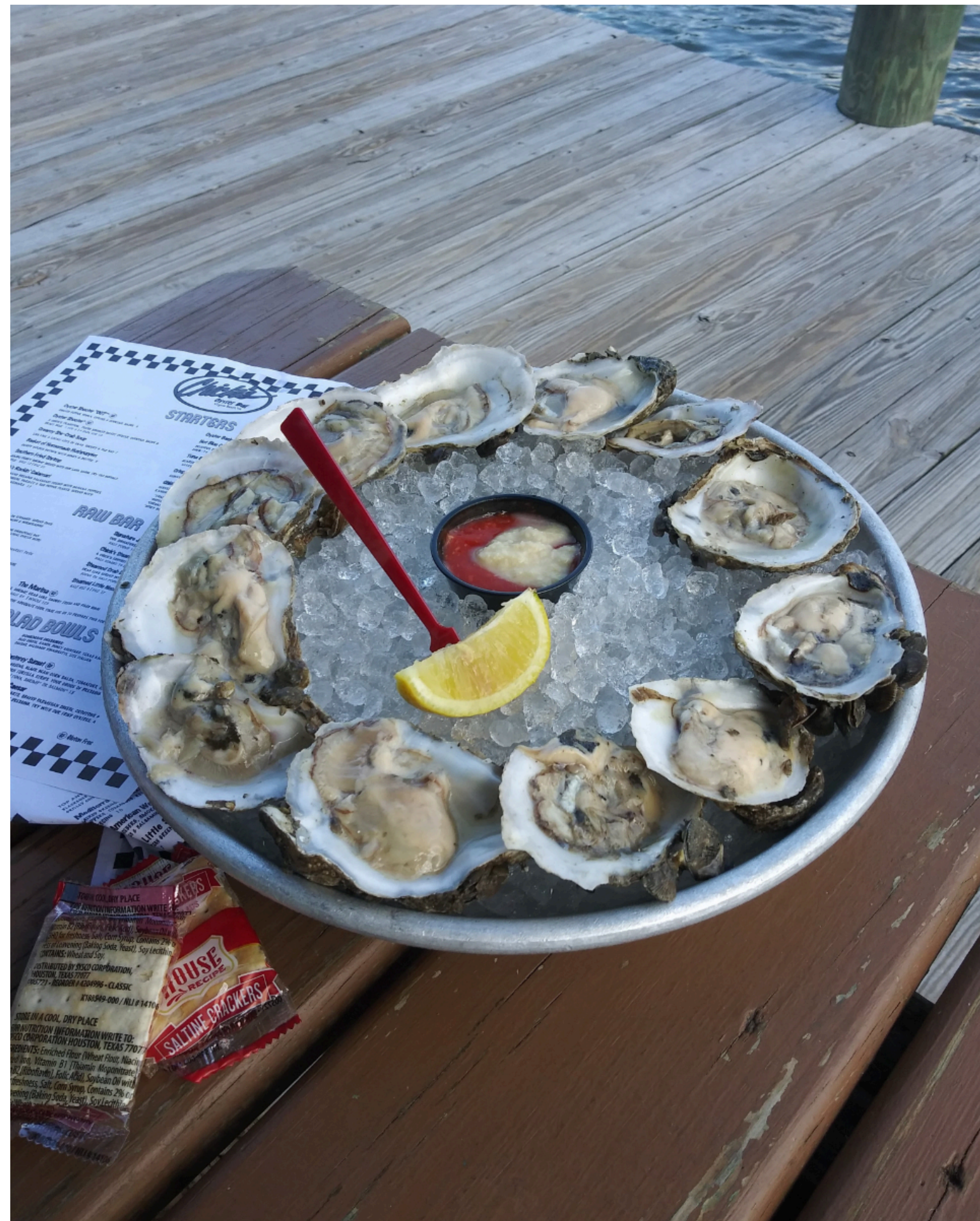
Entry - 4