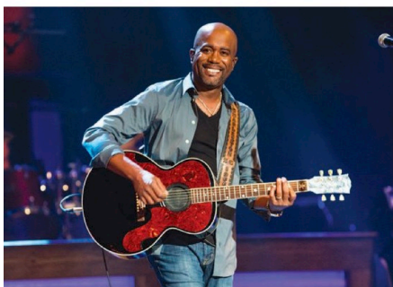
Darius Rucker performing at the Grand Ole Opry House