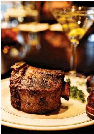
Manny's Steakhouse serves dishes made with locally sourced ingredients.