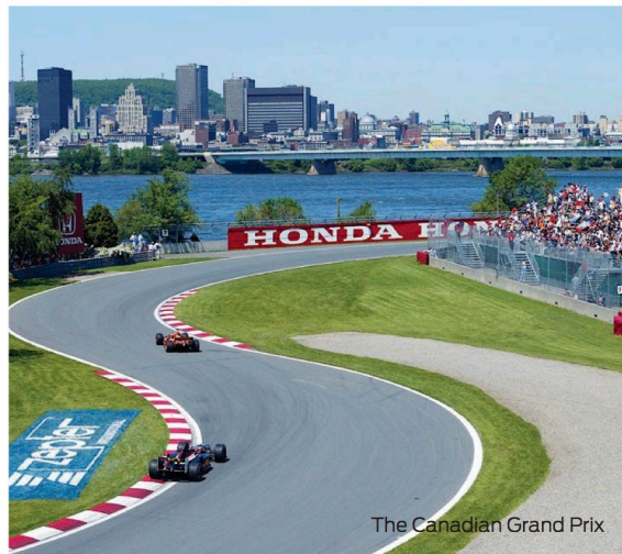
The Canadian Grand Prix