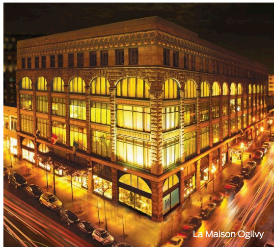
La Maison Ogilvy

European style reigns supreme in this fashionable city on the banks of the St. Lawrence River.