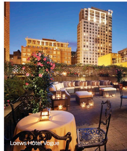
Loews Hôtel Vogue