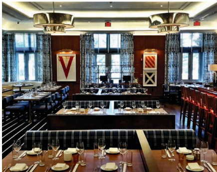
Diners can enjoy seafood, cocktails and cigars at Lure Fishbar.