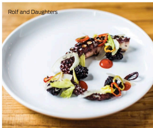
Rolf and Daughters