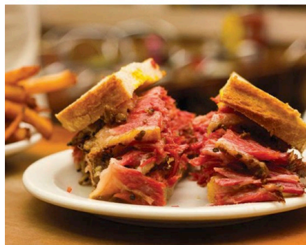
Schwartz's deli is a local favorite and a cultural institution.