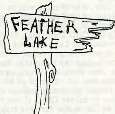
The EP/TPAS wildlife refuge is located at 9500 N. Loop Dr., El Paso.