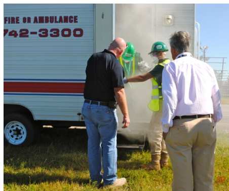
CERT members exit the Smoke House trailer in a cloud of smoke

CERTs were deployed to the Smoke House trailer to learn the proper method of escape during a fire. The Smoke House simulation illustrates another