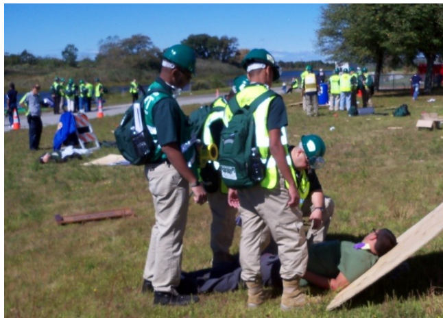
Obstacle Course Station

their counterparts from New York City and Suffolk County.