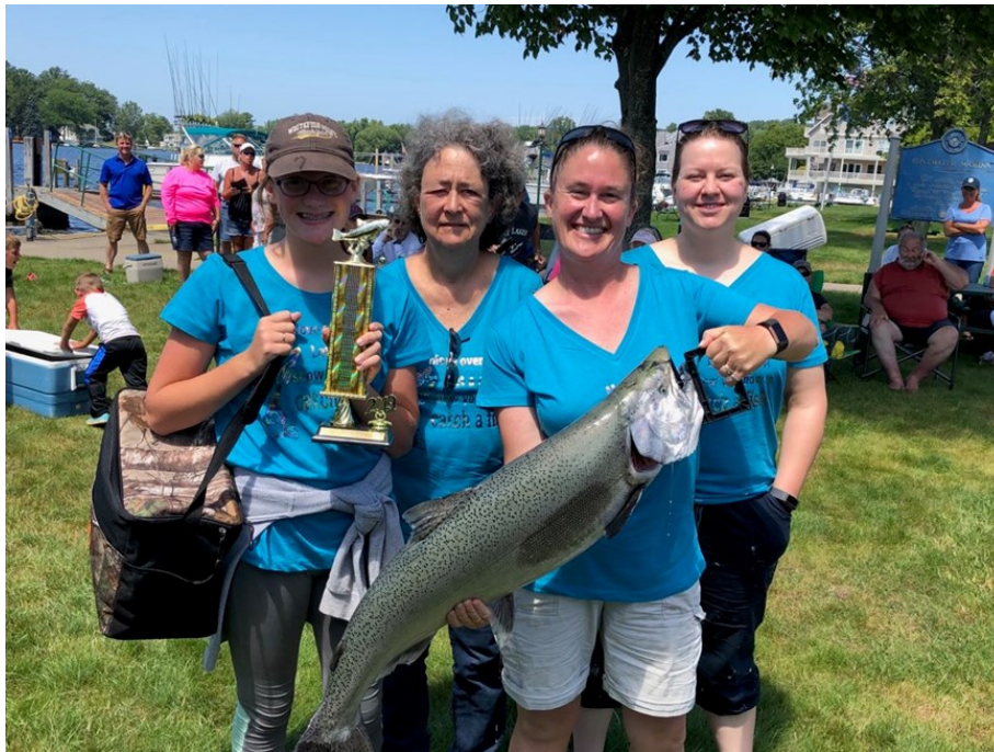
First Place – Big Fish- 27 lb King Salmon—Just Lookin'

XXXXXXXXXXXXXXXXXXXXXXXXXXXXXXXXXXXXXXXXXXXXXXXXXXXXXXXXXXXXXXXXXXXX