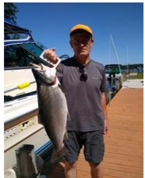
Palm Beach - 10.80# Coho - 8/13/19