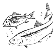
Dock Tales - 14.25# Brown Trout - 8/10/19