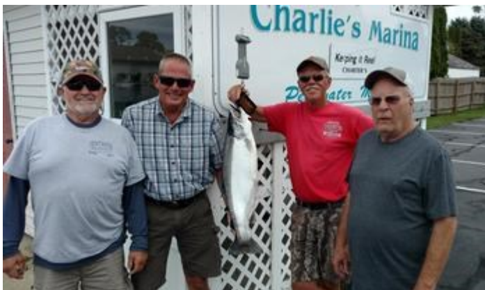
After Five - 13.30# SH - 8/14/19