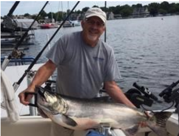
Dean's Dream - 36.90# King - 8/13/19