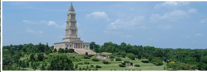
Inverted elevation as the Memorial is higher than the pyramidion of the ground layout yet both pinnacles denote a 5776 code.

The last day for the Stock Market rally will be on Sep 11, 2015 a 9-11