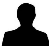
“The Great One”

Barack Obama’s approach to interpreting the Bible tends to be “eisegetical” while I do everything in my power to keep my interpretations entirely “exegetical.” (You can look those up!) – February 8, 2012