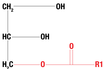
Figure 1. Monoglyceride Chemical Representation in MaxSimil Fish Oils (R1 = fatty acid)

Unique structure: One fatty acid attached to a glycerol backbone provides two polar ends that attract water and a non-polar tail end (R1) that attracts fat, thus enabling self-emulsification of the Omega Mono 650 EC formulas.