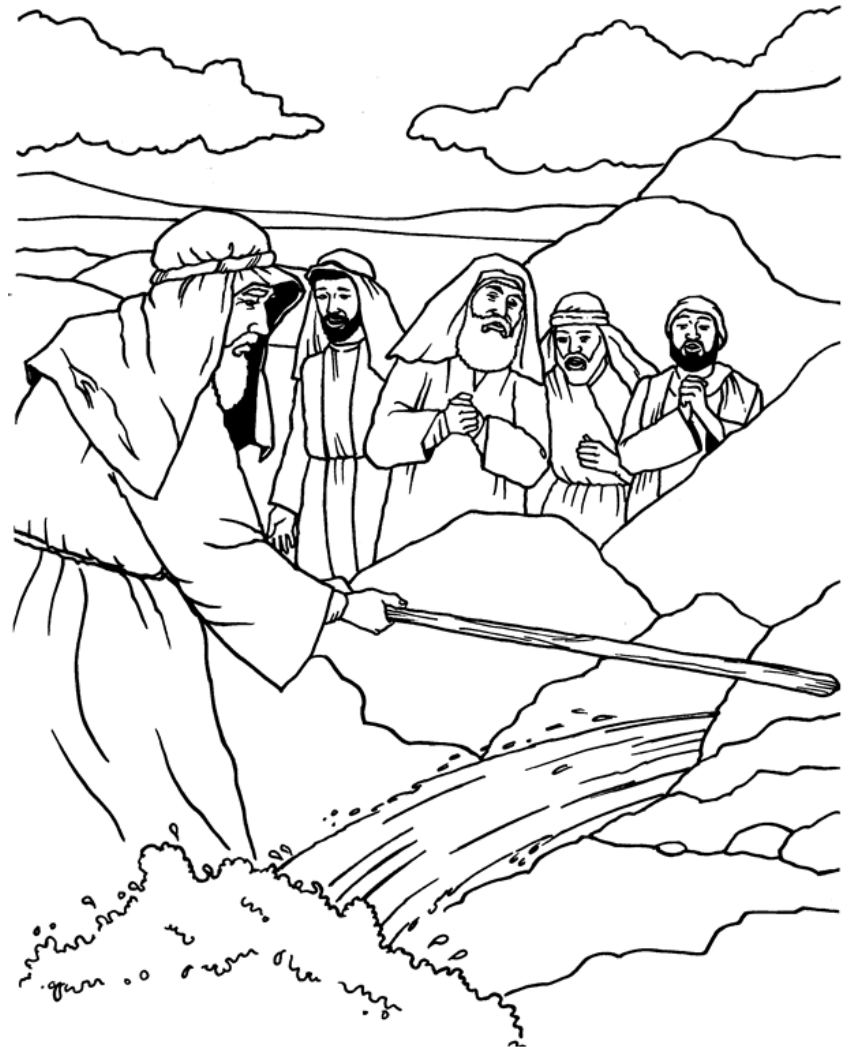
Moses Strikes the Rock Exodus 17:1-7

From BibleStoryCard Learning System(tm) Coloring Book © 1996 Wesleyan Publishing House Used by permission. Additional BibleStoryCard resources available by calling 1-800-493-7539 or visiting online http://www.parable.com/wph/group_1052.htm