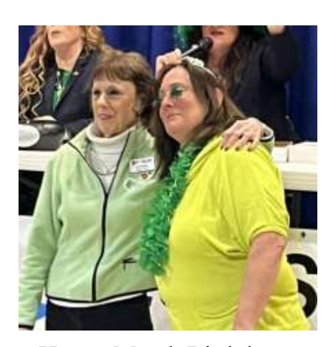
Happy March Birthdays