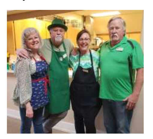
March Dinner Hosts