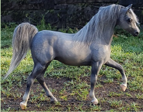
KT Der Wind 35 Years Old!