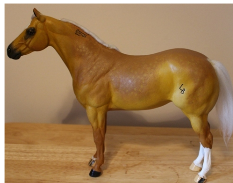
RESERVE CHAMPION CREAM/DUN COLOR: FIESTA JONES (LB)

Blanket Appaloosa (33): 1-Apache Magic Man (SSu), 2-Montana Cat (LB), 3-Arapaho Heights (JG), 4-Murphy's Law (APo), 5-Peppered Royal Smoke (JG), 6-Katarina (CM), 7-Dream Again (KM), 8-Oak's Dun Purrfect (CM), 9-Rock Ridge (JG), 10-Foxy Robin J (JG), HM-Class Action (CM)