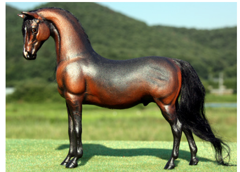
RESERVE CHAMPION BASE COLOR: LJ HIT IT HAL (SMB)

Dapple Grey (57): 1-Gossamer Wings (KW), 2-GGK Tiqatu (SN), 3-RM Nuclear Winter (KW), 4-RAS Elian Demoiselle (CM), 5-Tonnerre Deveroux (SSu), 6-PR Eldorado Spanish Rose (JV), 7-D.O. Sportin' Chance (BH), 8-La Paska (SSu), 9-RM Khryptic (APo), 10-Qalizii (SSu), HM-Tetrasina (KW)