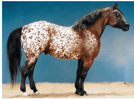
RES. CHAMPION MAJOR REMAKE/REPAINT/HAIR OR SCULPTED M/T: ROCKING CHAIR RENEGADE REVEL (CM)

Extreme Remake & Repaint w/Hair M/T: Trad. or Larger (10): 1-Diamond Handsome Devil (BH), 2-Birchwood Geisha Boy (BP), 3-Diamond Flame (SSu), 4-Diamond Fancy Cat (CM), 5-RM Bay Bandit (APo), 6-Brookridge Diamond II (APo), 7-SD Conversano Diamond (APo), 8-Merry Mountain Mist (APo), 9-Rockledge Diamond Lark (CM), 10-Handsome Stranger (SSt)