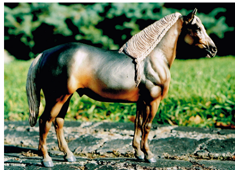
RESERVE CHAMPION SPORT BREED: BLAZE OF GLORY (APa)

Paso Fino/Peruvian Paso (9): 1-Huari-canga (KW), 2-LJ Abricotine Bleu (JV), 3-Marquesa (CM), 4-TS Jalapeno (MP), 5-TS Crystal Conchita (MP), 6-PR Balenciaga Brio (JV), 7-Lad Amigo (HC), 8-Raven (HC), 9-Tesoro D Oro (JW)