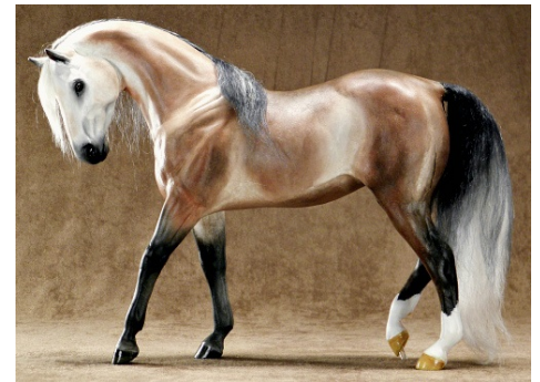
RES. CHAMPION SPANISH BREED: MALEGENA (CM)

American Saddlebred (17): 1-Capital Genius (HC), 2-Marvelous Marvin (HC), 3-HCF Black Watch (DC), 4-Fall Sunrise (HC), 5-TS Autumn Dancer (MP), 6-MN Jackie O (HC), 7-Highland's Captain Jack (NF), 8-Crown Royale (BA), 9-Autumn Storm (HC), 10-TS Equinox (MP), HM-Keepsake (HC)