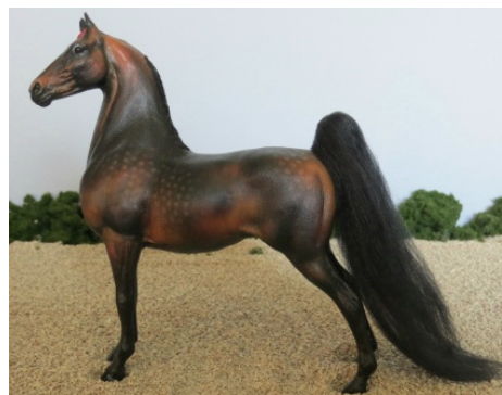
RESERVE CHAMPION GAITED BREED: DARK COMMANDER (CH)

Clydesdale/Shire (10): 1-Cedar Hill Duncan (VM), 2-Belle (HC), 3-Sparrowwood Beauty (SSu), 4-Dominion Blue Douglas (SSu), 5-Lady Of Trieste (CM), 6-Northrigg Sable (VM), 7-Castlekeep Mistress (LB), 8-Diamond Blue Rose (CR), 9-Royal Witch (APo), 10-Budweiser's Pride (MT)