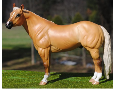
RES. CHAMPION FLOCKED/OTHER CUSTOM: SUPERBLY DUNN (SSu)