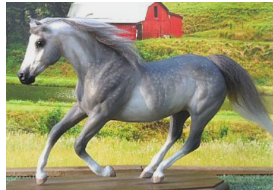
DIAMOND HANDSOME DEVIL