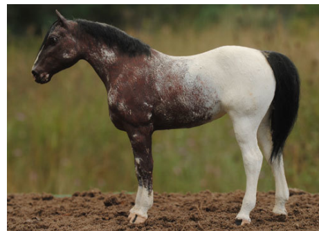
RESERVE CHAMPION REPAINT/HAIR OR SCULPTED M/T: CAYENNE'S CYETTE (SSu)

Simple Remake & Repaint w/Hair M/T: Trad. or Larger (6): 1-Nhi Vanye I Chyya (LB), 2-Cutter's Pokey Pine (CM), 3-Tejas Little Eagle (CM), 4-Diamond Red Hawk (CM), 5-Summer Breeze (SSu), 6-Polaris (SSt)