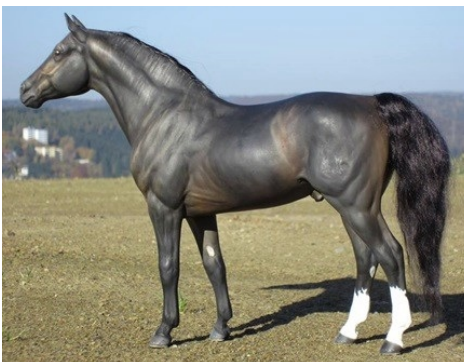
RES. CHAMPION SIMPLE REMAKE/REPAINT/HAIR OR SCULPTED MANE/ TAIL: AMANTUS VS (SN)

Major Remake & Repaint w/Hair Mane/ Tail: Trad. or Larger (82): 1-Ima Rock-a-teer (CM), 2-D.O. Sportin' Chance (BH), 3-Willie's Wyld Fire (RN), 4-Sparrowood Rob Roy (SSu), 5-Plastique (SSu), 6-RAS Elian Demoiselle (CM), 7-Hathor (SN), 8-Cutacross Shorty (SSu), 9-The Devil's Advo-