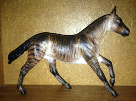
RESERVE CHAMPION OTHER COLOR: IMAGINE THAT (SR)

1980s COLOR DIVISION OVERALL CHAMPION: SMOKE BAR SYNDICATE (CC)