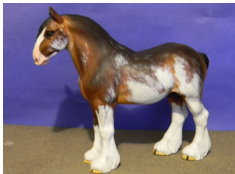
CHAMPION REPAINT: CEDAR HILL DUNCAN (VM)

Repaint: Smaller than Classic (8): 1-Charisma (CC), 2-DQ Jim Dandy (SSt), 3-Tanzer (CH), 4-En Fuego (CR), 5-Khrystal Music (CH), 6-Dexi's Midnight Runner (SSu), 7-Ravyn (SSt), 8-Rockin' Jade (HC)