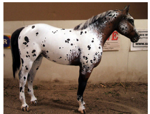
RESERVE CHAMPION PATTERNED COLOR: CLASSY LOVE (SSu)

Longear/Exotic (8): 1-Imagine That (SR), 2-Gentleman John (BH), 3-Gallimaufry (SSu), 4-Ironwood Glenn (SSt), 5-So Molson Canadien (SSu), 6-Bob