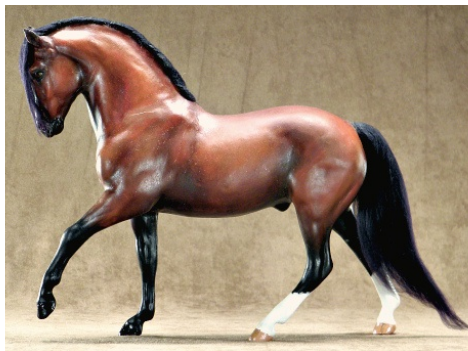
RESERVE CHAMPION SPANISH BREED: CAPRICHOSO (CM)

ASB (13): 1-Dark Commander (CH), 2-Business As Usual (HC), 3-Love N' Flames (CH), 4-Grey Mercedes (SSu), 5-Sir Arthur (HC), 6-LL Tidal Wave (SMB), 7-Manchester Memory (JW), 8-Diamond Sungold (APo), 9-Highland Heartbreaker (SSu), 10-Sundae Best (HC), HM-DQ Spicy Stepper (SSt)