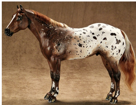
CHAMPION MAJOR REMAKE/REPAINT/HAIR OR SCULPTED MANE/ TAIL: IMA ROCK-A-TEER (CM)

Major Remake & Repaint with Non-Hair M/T: Smaller than Classic (1): 1-Wishful Thinking (KM)