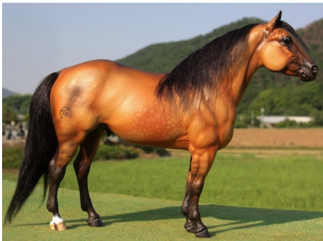
CHAMPION CREAM/DUN COLOR: BUCKTHORN (SMB)