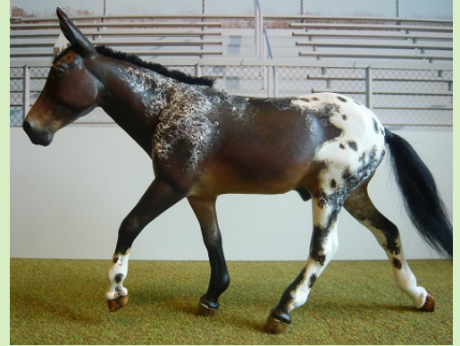
DA Bardigano Honest John 20 Years Old!

(Have one created in 1960, 1965, 1970, 1975, 1980, 1985, 1990, or 1995? Get it into the Birthday Barn spotlight by e-mailing its photo and info to our Gmail address below!)