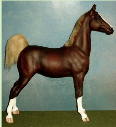
Foxy's Image 30 Years Old!