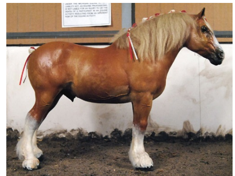
RESERVE CHAMPION DRAFT BREED: BILLFAR DU MARAIS (SSu)

American Pony (15): 1-21st Century Boy (KM), 2-Zip's Silver Lining (CM), 3-Confederate Gray (LB), 4-DQ Starsparkle (APo), 5-Paradox (SW), 6-BBG's Silver Ghost (CM), 7-DQ Butterscotch Brandy (APo), 8-Marshall Cody (LB), 9-The Paisley Palette (SR), 10-Zip's Diamond Jim (CM), HM-Empire's Fudge Sundae (CM)