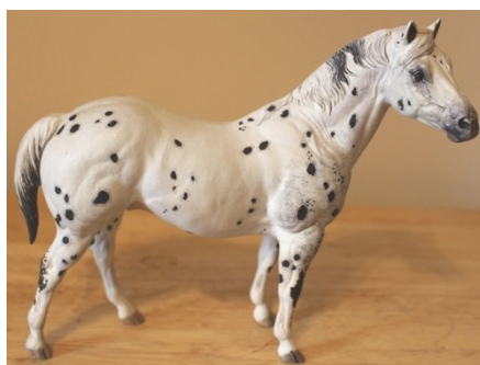
CHAMPION REPAINT: BROTHER LOVE (LB)

Repaint: Smaller than Classic Size (4): 1-Wing'd Jaguar (SSu), 2-Winds Of Change (CH), 3-Pick Me A Winner (APa), 4-Rihanna (APo)