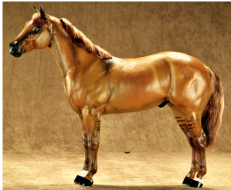
CHAMPION CREAM/DUN COLOR: KID'S SPANISH CASH (CM)

Dun/Gruella (12): 1-Kid's Spanish Cash (CM), 2-Mito's Something Wicked (SSu), 3-Confederate Gray (LB), 4-Seven S Rebel (LB), 5-Althea (SR), 6-Miss Smokum Royal (CM), 7-J's Muddy Dun (JG), 8-J's Copper Dun (JG), 9-Dakota Territory (JG), 10-KT Draublakken (JG), HM-Desert Medallion (RN)