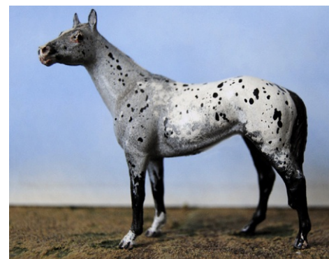
RESERVE CHAMPION SPORT BREED: WING'D JAGUAR (SSu)