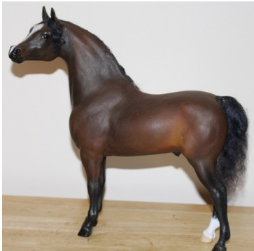
RES. CHAMPION SIMPLE REMAKE/REPAINT/HAIR OR SCULPTED MANE/ TAIL: NHI VANYE I CHYYA (LB)

Major Remake & Repaint with Hair M/T: Trad. or Larger (8): 1-Rocking Chair Renegade Revel (CM), 2-Penny Arcade (BP), 3-Indiana Jones (LB), 4-Alconbury Star-bringer (SSu), 5-Telemann (LB), 6-Brookridge Diamond (LB), 7-Diamond Legacy (SSu), 8-Moonlight Nugget (HC)