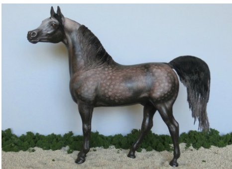
CHAMPION MAJOR REMAKE/REPAINT/HAIR OR SCULPTED MANE/ TAIL: *THE RAISULI (CH)

Major Remake & Repaint w/Hair M/T: Smaller than Classic and Major Remake & Repaint w/Non-Hair M/T: Classic and Smaller than Classic: none