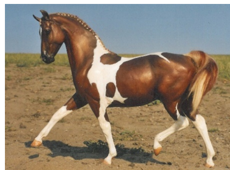
CHAMPION SPORT BREED: FLYING DUTCHMAN (JG)

Other Pure or Mixed Sport Breed (7): 1-Blank Stare (SR), 2-Ethereal Breezy V (BK), 3-Tug Hill By Design (CM), 4-Heartlight (HC), 5-Air Mail Special (APa), 6-After Thoughts (HC), 7-TS Fire On The Mountain (MP)