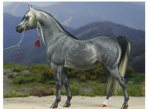
CHAMPION REPAINT/HAIR OR SCULPTED MANE/TAIL: MON'NAFA RANI (CR)

Repaint with Non-Hair Mane/Tail: Smaller than Classic: no entries