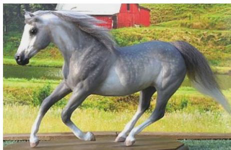
CHAMPION EXTREME REMAKE/REPAINT/HAIR OR SCULPTED M/T: DIAMOND HANDSOME DEVIL (BH)

Extreme Remake & Repaint w/Non-Hair M/T: Classic and Smaller than Classic: no entries