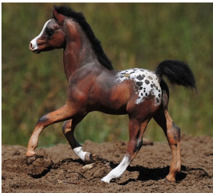
CHAMPION FOAL: BETTE B BADD (SSu)

Longear/Exotic/Fantasy Foal (9): 1-Beakman (SSu), 2-Waltzing Matilda II (HC), 3-Harry (HC), 4-Miss Moody (HC), 5-Jewels (HC), 6-Grits (BH), 7-Roberto (BA), 8-Jose (BA), 9-Samuel (BA)