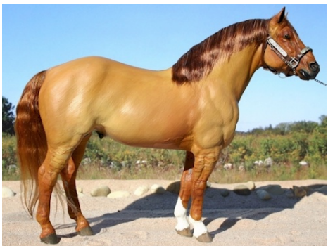
RES. CHAMPION CREAM/DUN COLOR: TS GRASSLAND SUNRISE (MP)

Blanket Appaloosa (34): 1-Ima Rock-a-teer (CM), 2-Bette B Badd (SSu), 3-Impressive Too (JG), 4-Gojaki (RN), 5-Impressive Heart (JG), 6-I'm Impressed (SN), 7-D's Stornaway Mister Blue (JV), 8-Kid Quannah (JG), 9-Heza Hobo (HC), 10-LBR Acadie (JG), HM-LBR Doc Sam Pedro (JG)