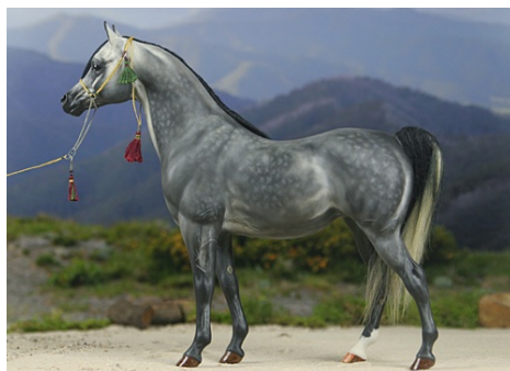
CHAMPION LIGHT BREED: MON'NAFA RANI (CR)

Other Pure or Mixed Light Breeds (3): 1-The Flying Dun (CM), 2-Rastaman (BP), 3-Skartaris (CH)