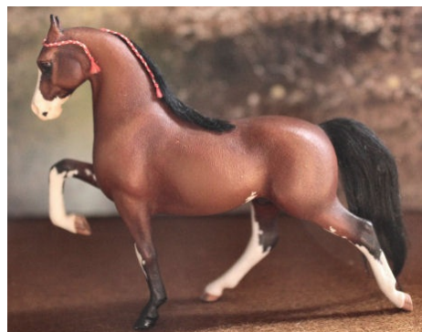
CHAMPION GAITED BREED: FLIP THE SWITCH (HC)

Other Pure or Mixed Gaited Breed (2): 1-Mr. Majestic (SSt), 2-Taxi Dancer (SSu)