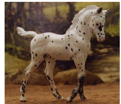
RES. CHAMPION FLOCKED/OTHER CUSTOM: RICATEZ (APo)

1960s/1970s WORKMANSHIP DIV. OVERALL CHAMPION: BROTHER LOVE (LB)