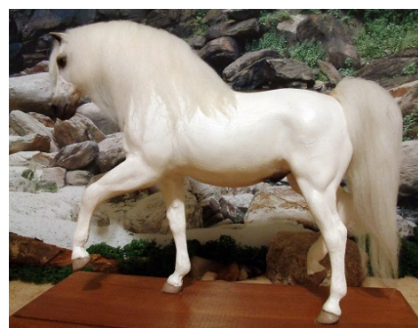
CHAMPION SPANISH BREED: SD CONVERSANO DIAMOND (APo)

Oth. Pure/Mix Spanish (1): 1-SD Conversano Diamond (APo)