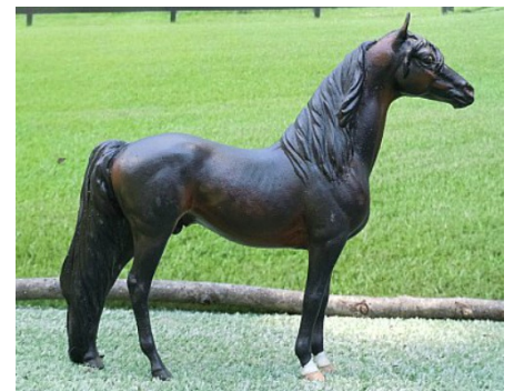
RES. CHAMPION REPAINT/HAIR OR SCULPTED MANE/TAIL: BLACK CAVIAR (BH)

Simple Remake & Repaint w/Hair M/T: Traditional or Larger (65): 1-Amantus VS (SN), 2-LBR Doc Sampedro (JG), 3-Walad (SN), 4-TS Bonnie Red (MP), 5-TS Dragon Warrior (MP), 6-Red Rebel (SSu), 7-RM Two-Tone Starburst (CM), 8-Rumneyhill Victoria (SN), 9-D.O. Go Wild (RN), 10-D.O. Sky Dreams (RN), HM-Ahvaz Zeenat (SN)