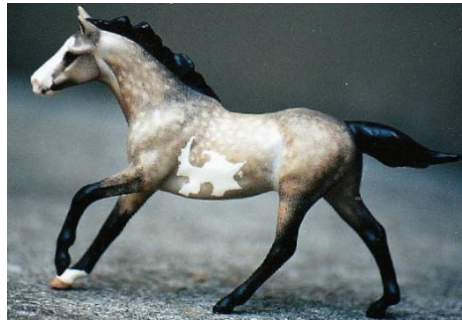
RES. CHAMPION REPAINT: BLACKBERRY LANE NOTORIOUS (SR)

Repaint w/Hair M/T: Trad. or Larger (39): 1-GGK Tiqatu (SN), 2-Golden Malicious (SMB), 3-TS Galilean Dragoness (MP), 4-PR Eldorado Spanish Rose (JV), 5-TS Squall Line (MP), 6-TS Jalapeno (MP), 7-Buckthorn (SMB), 8-LBR Blue-Eyed Elaine (JG), 9-PR Wharram Percy (JV), 10-Brecon Apollo (KM), HM-TS Autumn Dancer (MP)