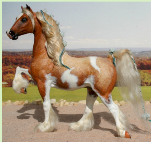
TS Autumn Nor'easter 25 Years Old!