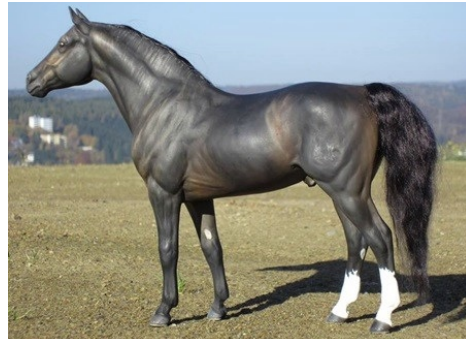
CHAMPION SPORT BREED: PR AMANTUS VS (SN)

1-Solid Citizen (CM), 2-PR Murphy Brown (JV), 3-PR Rosie O'Grady (JV), 4-I'm Impressed (SN), 5-Parklane Oystercatcher (JV), 6-Fiesta Time (SSt), 7-PR Wharram Percy (JV), 8-Kamtara Colorado Autumn (JV), 9-Mr Darcy (SN), 10-Au Chocolat (APa), HM-CL Thunder Rolls (HC)