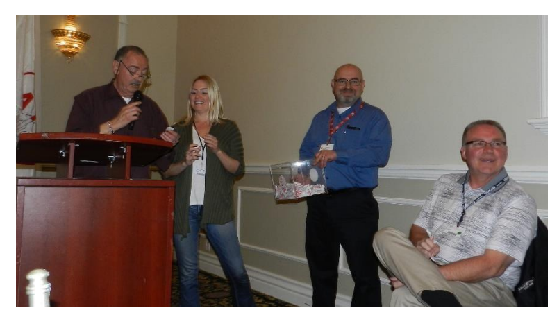
Drawing cards for the winners!

The Automotive Transportation Service Superintendents' Association is a not-for-profit organisation ATSSA: The home of Fleet Maintenance Managers Always Thinking Safety Page 6 of 6