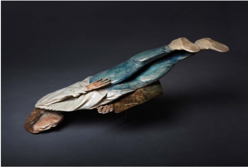
Yi Hwan Kwon: A Puddle 3, steel and cement

While demonstrably more optimistic than Dick, and importantly, being of a generation who grew up in a post-digital world of wonder, to Yi Hwan-kwon's mind, the dominant quality of modern existence is tension. We exist in a kind of self-made limbo between isolation and connection, individual and society, real and virtual, phenomenon and invention, in which everything is flattened, condensed, trapped, and made relative. In his illusionistic manipulations of the human body — as represented by an eclectic array of exemplar citizens both anonymous and archetypal — Yi Hwan-kwon seeks to give durable physical form to a cluster of ideas about energy and cognition.