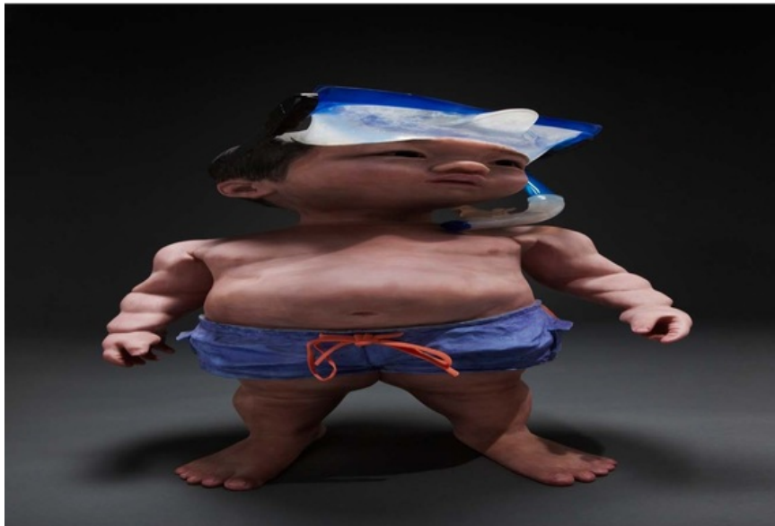
Yi Hwan Kwon: Beach, 2013, hand-painted acrylic

Yi Hwan Kwon's eccentric and arresting sculptures and environmental installations are both the sites and the triggers for an explosion of cognitive and visceral dissonance. Cheerfully brimming with paradox, his distorted statuary of modern people have the immediacy and surprise energy of Pop Art, but none of its flashy, high-calorie excesses. Instead, these object-images offer nuanced disorientation; they are as much about direct experiential materiality as they are about deracinated, mediated perceptions. They offer poetic personal narrative and socio-political analysis. They speak simultaneously in the languages of art history and science fiction. Like Helen of Troy, each of his faces launch 1,000 ships of inquiry.