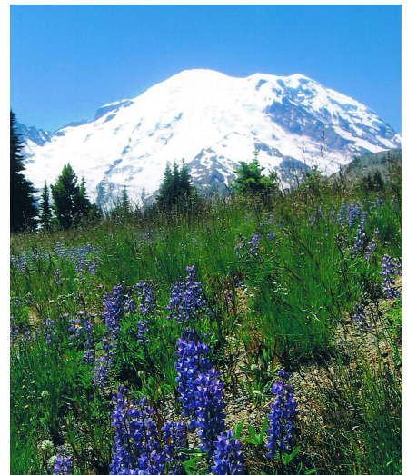
Wild Flowers at Mt Rainier

You are invited to join us for rug braiding in the beautiful Pacific Northwest!