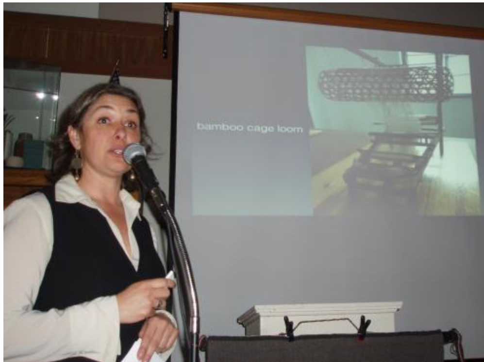
Photo Gallery...March Guild Meeting