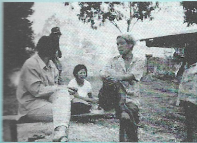
chapter 3: art of interviewing