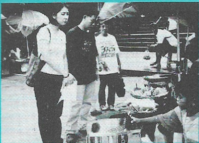
chapter 5: ethnography