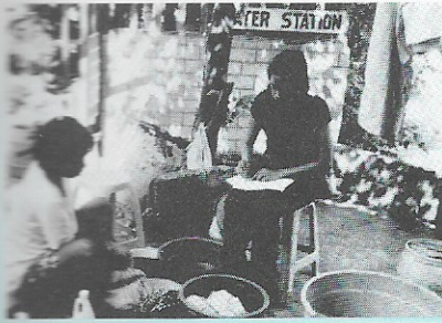
chapter 2: survey questionnaire