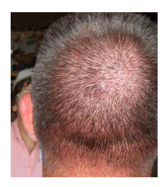
Photo on the right shows the results of attending the Lightning Fly-In and listening to some of the hair raising hangar talk sessions.