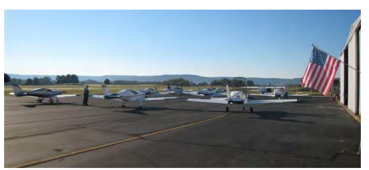
Photo left - Saturday morning on the way to Winchester for the EAA breakfast. Photo right - Lightnings on the ramp at Winchester.