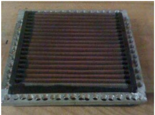
K&N filter with the spacer that Corky used as an attempt to provide more airflow through the air box. Note the filter pleats running left and right (horizontal) in this photo.

In looking at the suggestion of adding a spacer to increase the area behind the air filter, I have noticed a small possibility of increasing air in this area. Most of us are using the K&N filter and it has pleat's which give it more filtering mass. The air enters the side of the compartment and flows across filter and then through it. If one places the filter so the pleats are running vertical there is restriction as the flow crosses each pleat. If the pleats are horizontal there is less blocking of the flow. This is a minor effect but every little bit helps. I hope I have described this so it can be understood. Tex