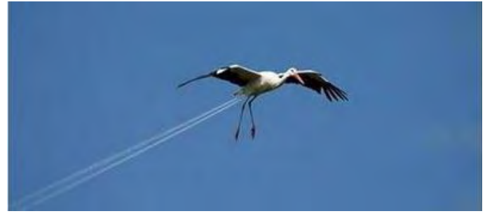
No, it isn't photo shopped; it is just a photographer's lucky timing.