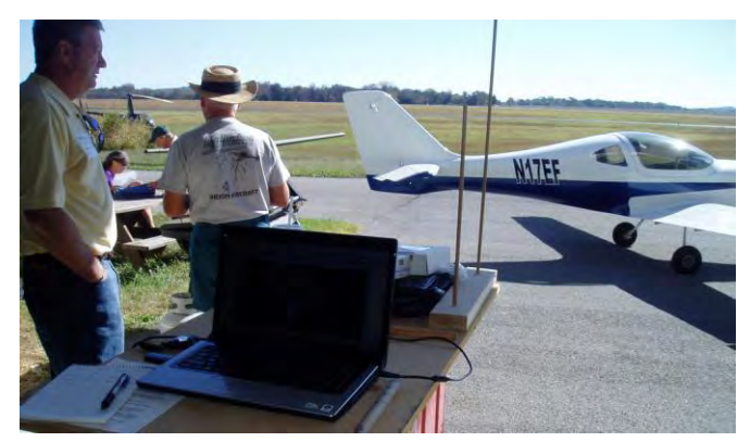
Official timing station - computer locked on to WWV for accurate time and starting line sighting device. There was a similar sighting device for the finish line.

Winning aircraft in each race class (light sport or unlimited) was the lowest total time.