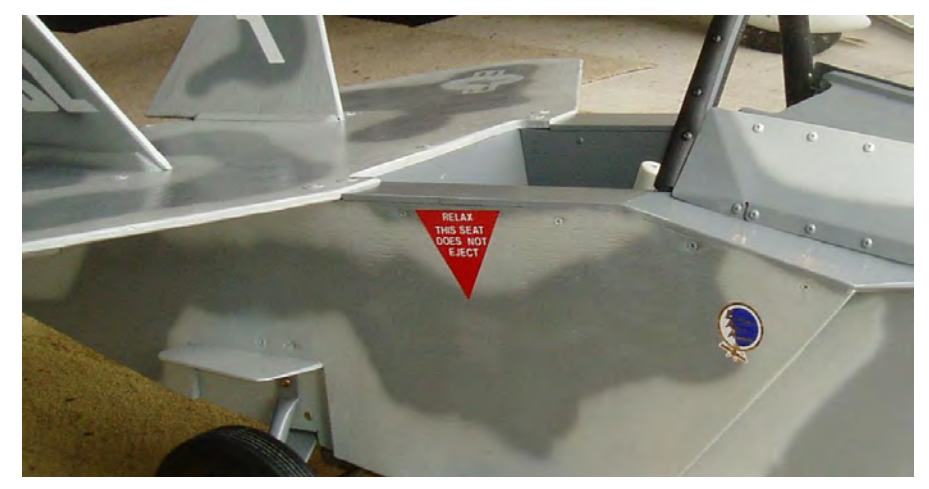
Don't worry, parents, the seat will not actually eject your child prodigy.