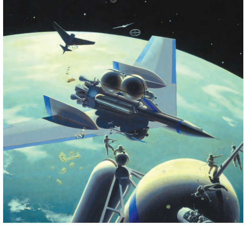
"Assembling the Ships for the Mars Expedition" (1956), by Chesley Bonestell

"Saturn as Seen from Mimas" (1944), by Chesley Bonestell