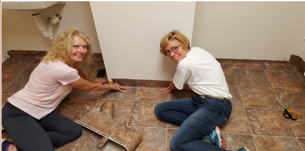
GIRL POWER! INSTALLING THE MEN'S BATHROOM FLOOR