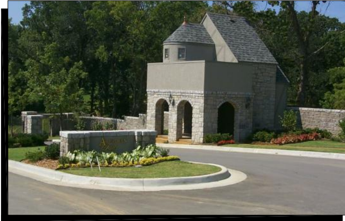
Aberdeen Falls Master Planned Community - Jenks