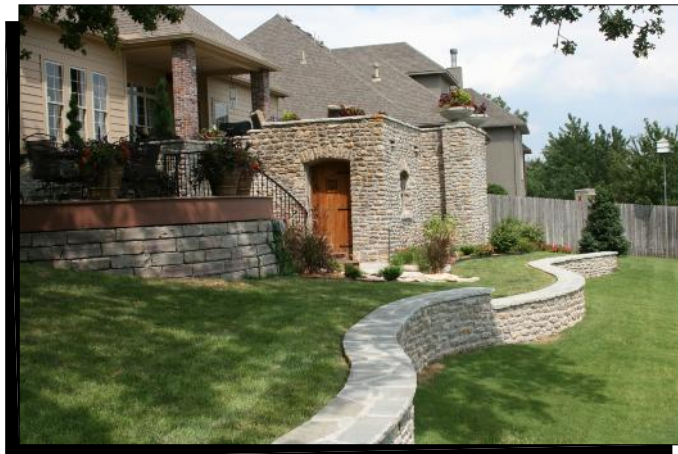
Back Yard Master Plan and Deck Structure - Bixby