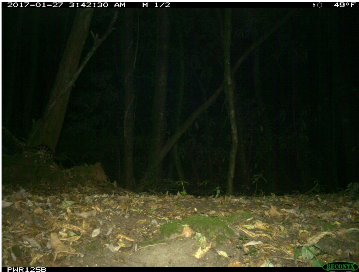
Figure 2. Spotted Linsang Prionodon pardicolor near Pyanwa dada, Nepal.

Spotted Linsang had never been photographed in Nepal prior to the present survey and there was no verifiable records from the country since those of Hodgson in the 1840s. The present records are approximately 5 km west of the westernmost limit of the species' mapped global distribution range from The IUCN Red List of Threatened Species (Duckworth et al. 2016). Further exploration could provide information on its status in the areas West of the Sikles-Bhujung landscape, because this part of Nepal remains inadequately surveyed for small carnivores. Although, given the species high tolerance and persistence in areas with few other small carnivores left (e.g., PAs in Vietnam), it is likely the species is not a priority.