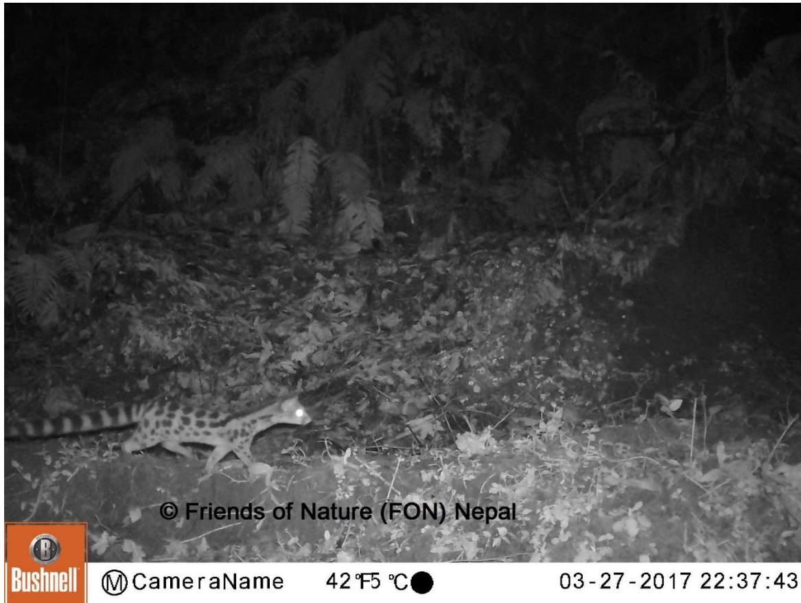
Figure 3. Spotted Linsang Prionodon pardicolor captured at Chyarsikharka, Nepal.

South-east Asia (e.g., Duckworth 1997, Than Zaw et al. 2008, Gray et al. 2014, Chua & Lim 2017) suggests the possibility that it would face no threats from human activity in this part of Nepal.