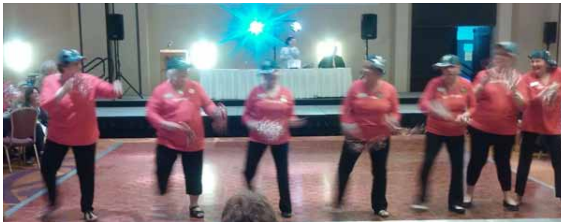
F.R. Board entertained with a board dance