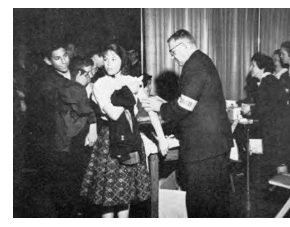
RIMS' Exhibition of Health Progress included free vaccinations against polio.

visitors to "the greatest audio-visual health education program for the public ever staged in New England." The Society's nine-day "Exposition of Health Progress" took place in the Cranston Street Armory April 6–14, 1962. More than 200 members of the Society served as volunteer docents.