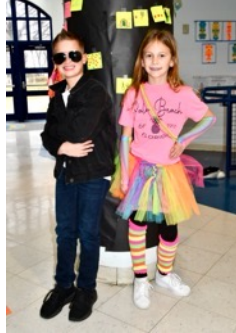
Tuesday's Spirit Day was "Kindness Rocks!"