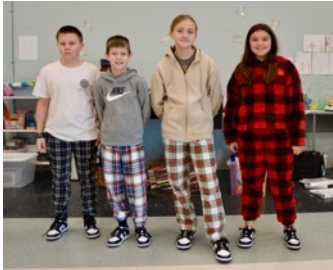
Monday's Spirit Day was "Dreaming of Kindness".

Our students and staff are enjoying celebrating Kindness Week! Kindness is a core Christian value that is emphasized in the teachings of Jesus. The Gospels emphasize love, compassion, and treating others as one would like to be treated. Everything our students are learning and practicing this week is an opportunity to foster a deeper understanding of our faith.