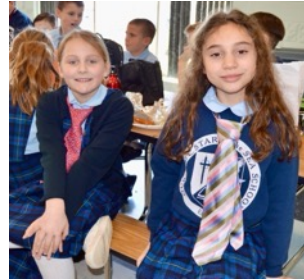
Today's Spirit Day was "Tied Together by Kindness".