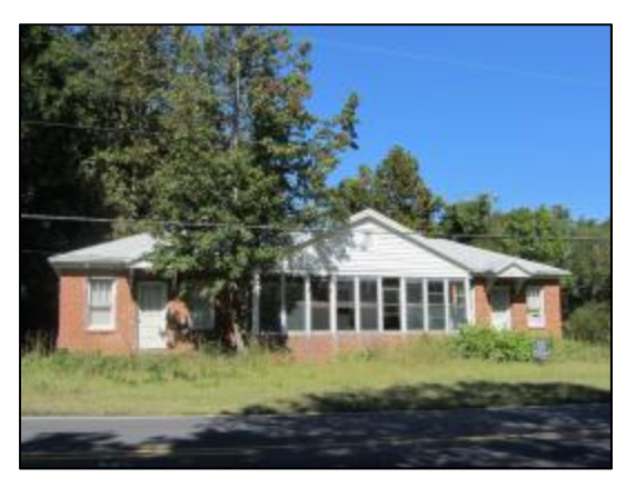
NCDOT Survey #56, DeGrom Triplex (GF-8214), 5503–5505 Burlington Road, looking northeast.

Property Description: Constructed in 1932 according to Guilford County tax records, this brick triplex is located close to Burlington Road and is oriented to the south. This nine-bay building is of balloon frame construction clad with brick veneer, rests on a continuous brick foundation, and is sheltered by a hip roof clad in