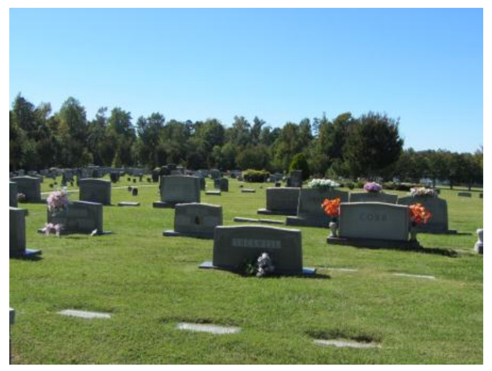
Figure 124. NCDOT Survey #59, Mount Pleasant Baptist Church (GF-8215), 5210 Burlington Road, looking west from front of church building.