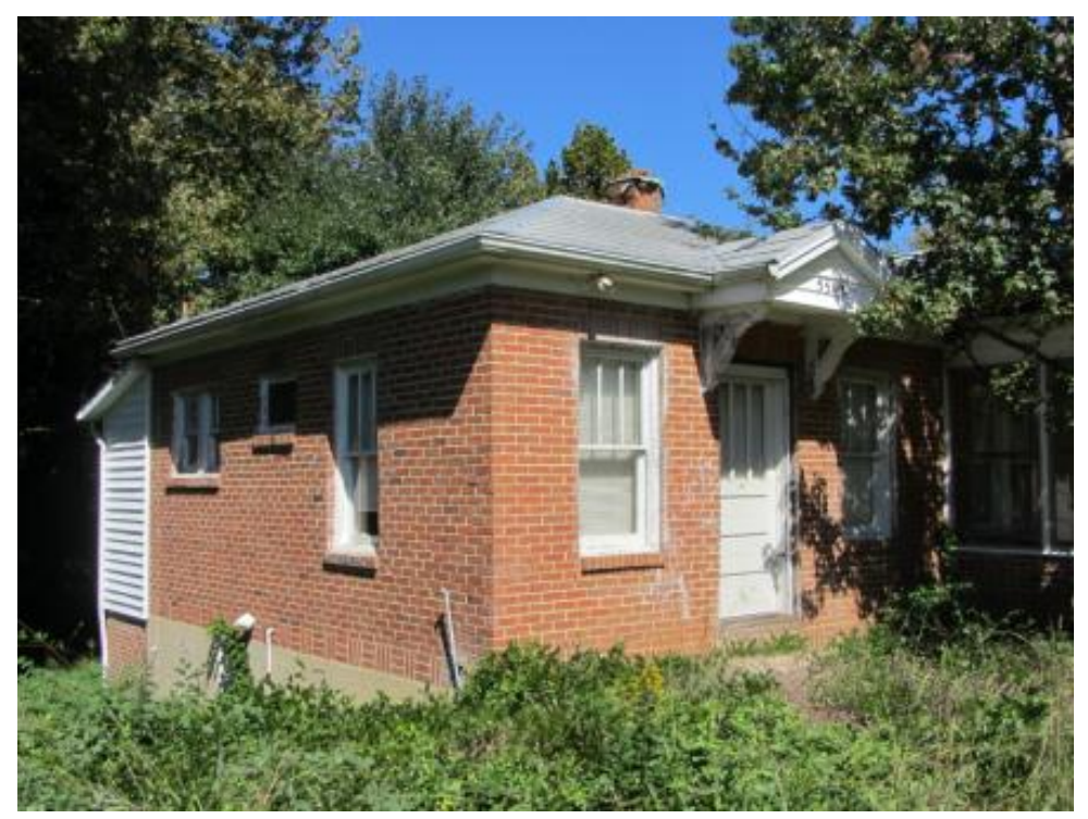
Figure 120. NCDOT Survey #56, DeGrom Triplex (GF-8214), 5503–5505 Burlington Road, Guilford County, view of westernmost unit, looking northeast.

Figure 119. NCDOT Survey #56, DeGrom Triplex (GF-8214), 5503–5505 Burlington Road, Guilford County, looking northwest.