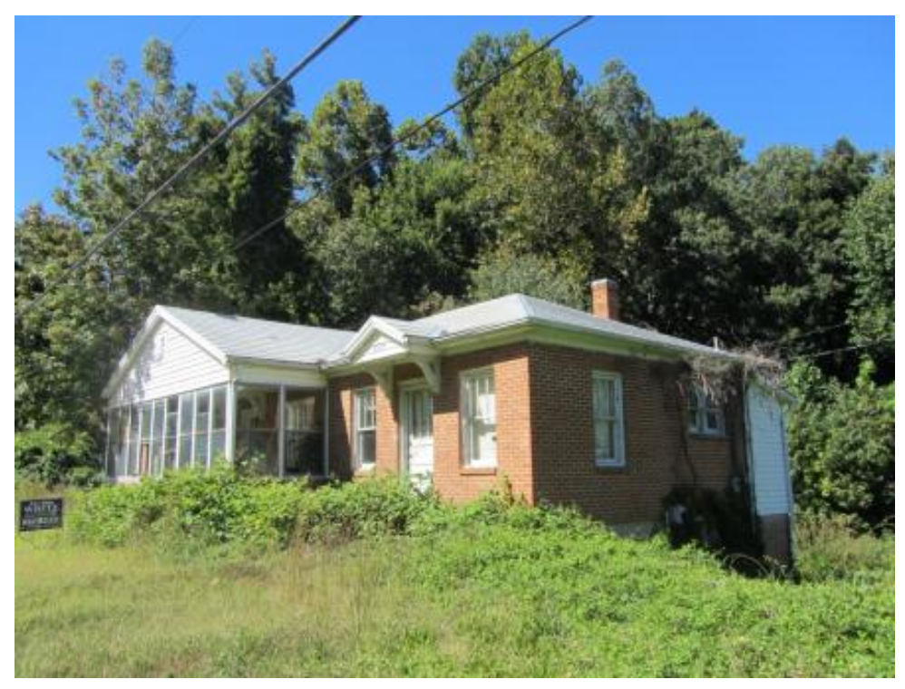
Figure 119. NCDOT Survey #56, DeGrom Triplex (GF-8214), 5503–5505 Burlington Road, Guilford County, looking northwest.