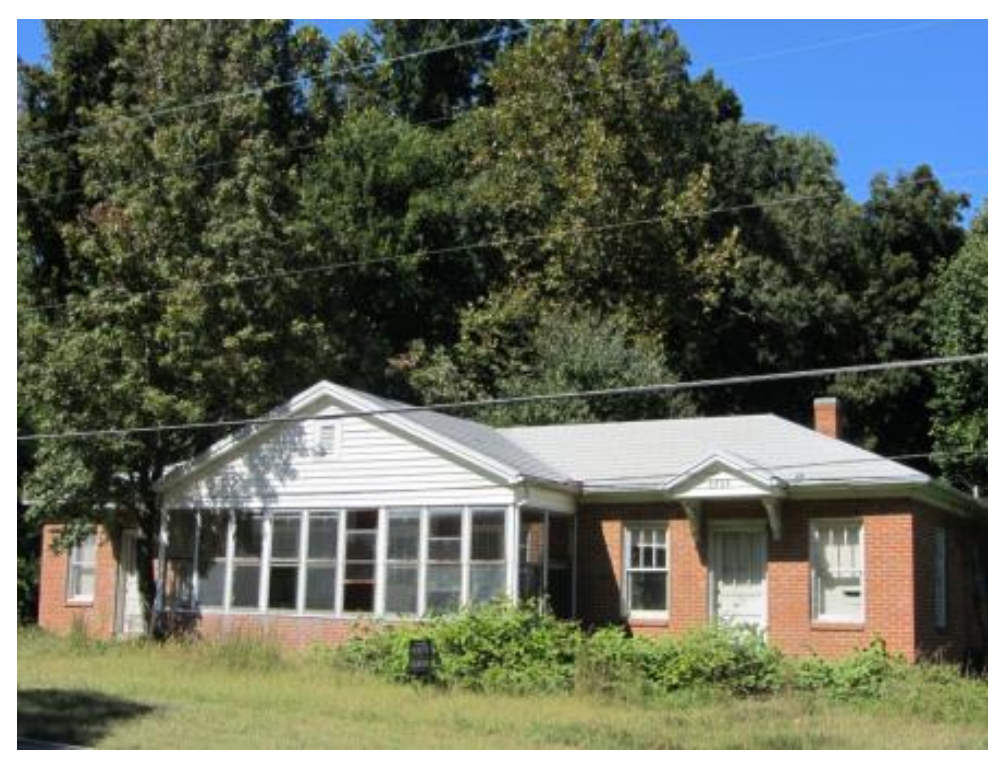
Figure 118. NCDOT Survey #56, DeGrom Triplex (GF-8214), 5503–5505 Burlington Road, Guilford County, view of south façade, looking northwest from US 70.

Figure 117. NCDOT Survey #56, DeGrom Triplex (GF-8214), 5503–5505 Burlington Road, Guilford County, looking northeast from south side of US 70.