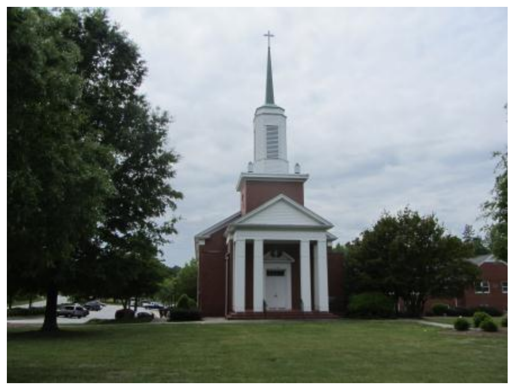
Figure 122. NCDOT Survey #59, Mount Pleasant Baptist Church (GF-8215), 5210 Burlington Road, façade, looking south from US 70.

Historic Structures Report for U-2581B/R-2910 Alamance and Guilford Counties, NC May 2013