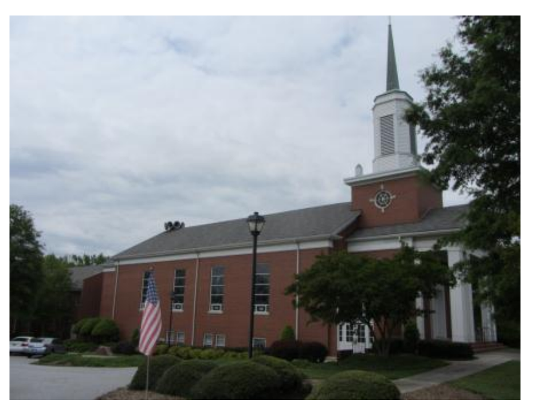
Figure 123. NCDOT Survey #59, Mount Pleasant Baptist Church (GF-8215), 5210 Burlington Road, looking southwest.