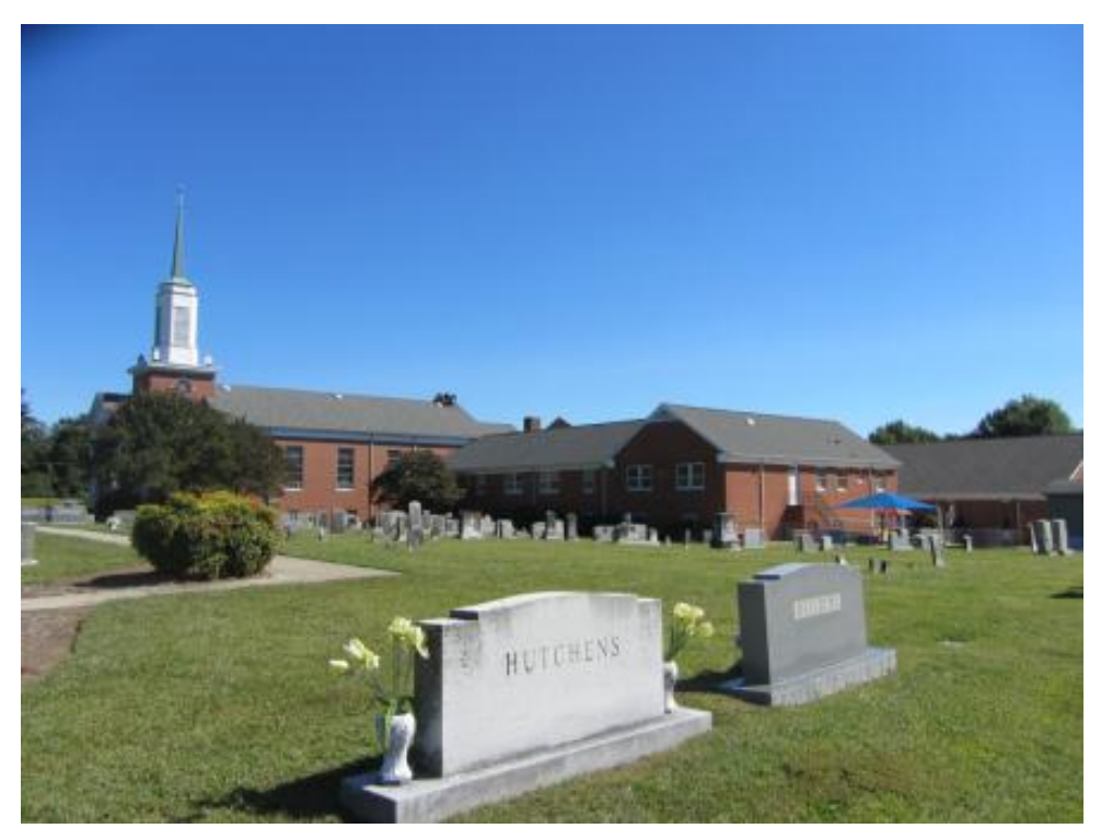
Figure 125. NCDOT Survey #59, Mount Pleasant Baptist Church (GF-8215), 5210 Burlington Road, looking southeast from cemetery with church on left and educational wing on right.