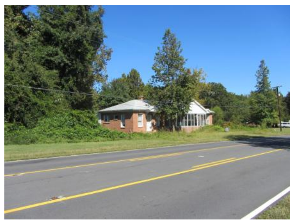
Figure 117. NCDOT Survey #56, DeGrom Triplex (GF-8214), 5503–5505 Burlington Road, Guilford County, looking northeast from south side of US 70.