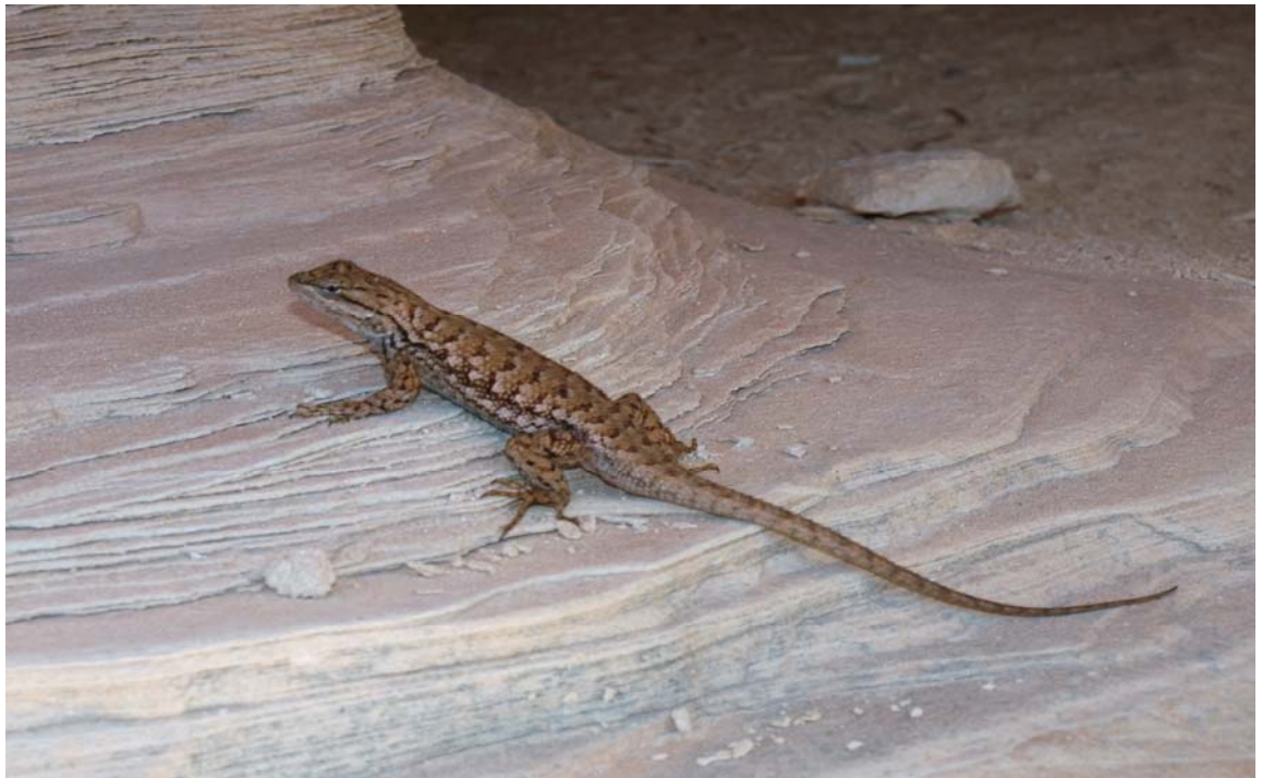
Rock of the Month SANDSTONE