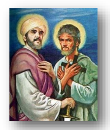
Feast Day: May 3

On one occasion, when Jesus saw the great multitude following him and wanted to give them food, he asked Philip where they should buy bread for the people to eat. Saint John comments, "[Jesus] said this to test him, because he himself knew what