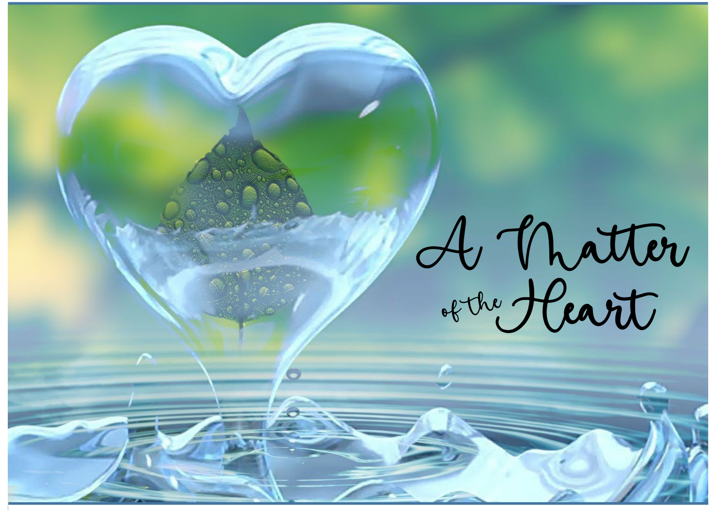
May You Find Christ Here...May You Bring Christ to the World!