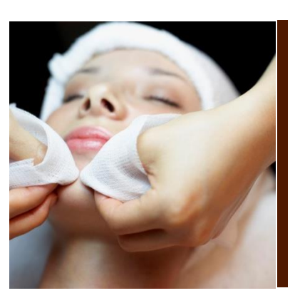
Master Esthetician (600) Hour Program

(Including Practicals, Bookwork, & Student Clinic Services)