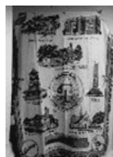
Quilt ~ $49.95