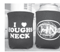
HN Can Koosie's ~ $3.00