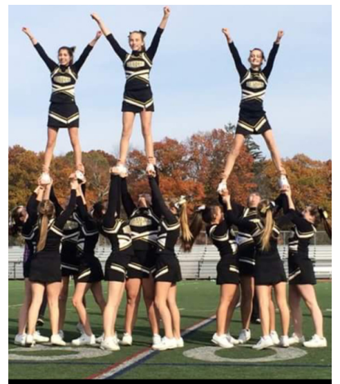
2014 Manet Cheerleaders perform at halftime of the Championship Game

The team is run by a Franchise holder. Over the years the Manets