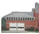
Houghs Neck Fire Station 6" X 4-1/4"