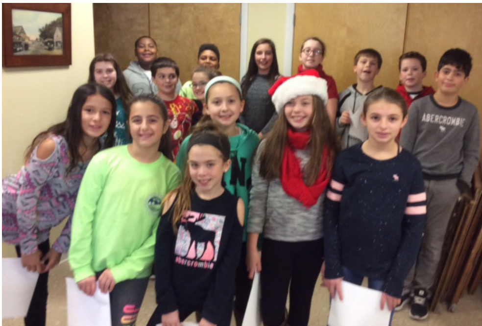
The fifth grade students from Atherton Hough School sang for the seniors.

Web: www.houghsneck.org Facebook: houghsneckcommunitycouncil houghsneckcommunitycenter Email: hncbulletin@yahoo.com