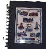
Journal ~ $10.00 7-1/4" X 5-1/2"