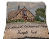
MBS Church Pillow 16" X 16"