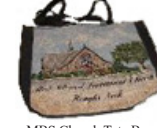
MBS Church Tote Bag 16" X 16"