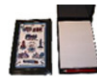
Note Caddy/Pad & Pencil $7.00 6-3/4" X 4-1/2"