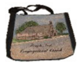
HN C Church Tote Bag 16" X 16"