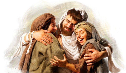
Feast Day: July 29

St. Martha is the patron saint of cooks, homemakers and restaurant servers. Martha, Mary and Lazarus together of the patron saints of siblings.