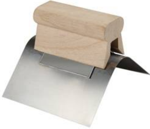
3-1/2"x2-1/2" Stainless Steel Outside Corner Tool - 1/2"R PL017