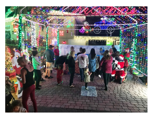
The crowd was huge every night