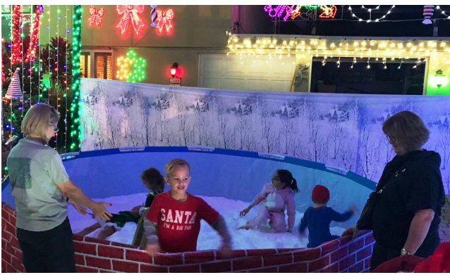
Kids enjoying the snow pit.

This article originally appeared in Fort Lauderdale magazine. Reprinted with permission.