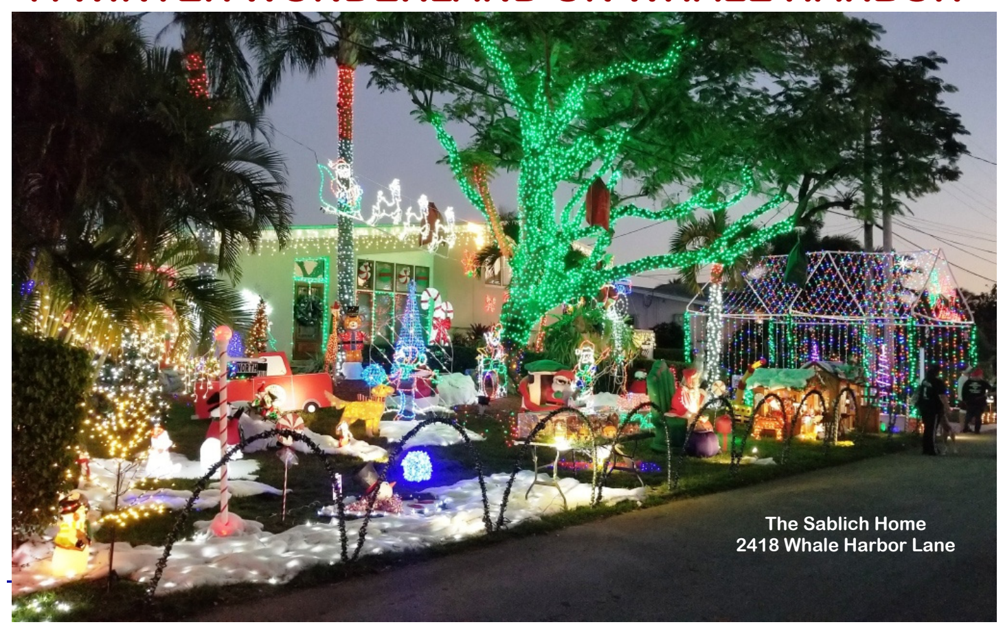
The Sablich Family on Whale Harbor Lane always goes all out with their fabulous Christmas display. This year's was the biggest and best yet. And they supported a very worthy cause, too. See the article and picture inside this issue.