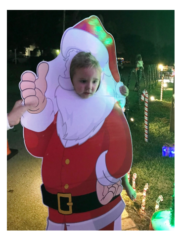
Lots of fun