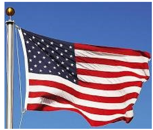
Fly your Flag Especially on the 4th of July *********