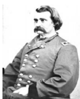
General John A. Logan

By the late 1800s, many communities across the country had begun to celebrate Memorial Day and, after World War I, observances also began to honor those who had died in all of American's wars. In 1971, Congress declared Memorial Day a national holiday to be celebrated the last Monday in May. (Veterans Day, a day set aside to honor all veterans, living and dead, is celebrated each year on November 11.) Today, Memorial Day is celebrated at Arlington National Cemetery with a ceremony in which a small American flag is placed on each grave. Also, it is customary for the president or vice-president to give a speech honoring the contributions of the dead and lay a wreath at the Tomb of the Unknown Soldier . About 5,000 people attend the ceremony annually.