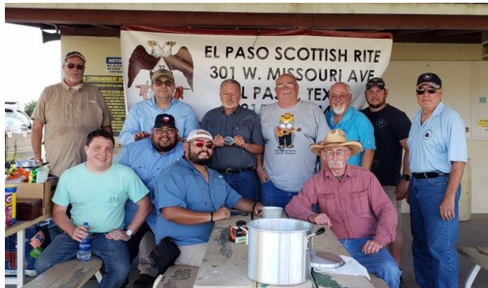
El Paso Scottish Rite Trap Shoot