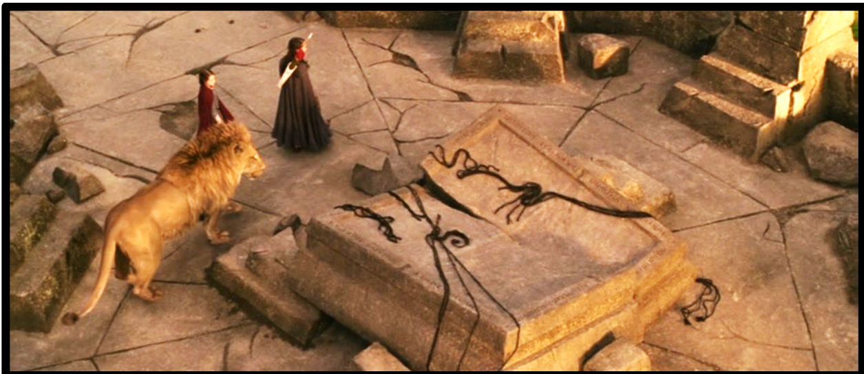
The Stone Table from The Lion, the Witch and the Wardrobe

(If you have never read [or can't remember well] CS Lewis's book, The Lion, the Witch and the Wardrobe , this might be a good read for this lesson. The movie is nowhere near as good.)