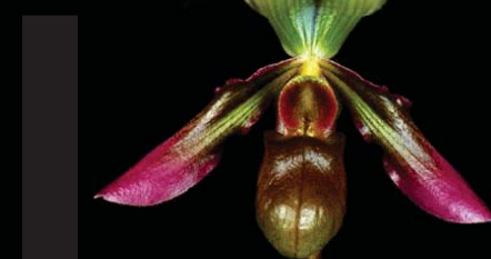
Paph. hookerae 'Magnifico' AM-AOS #2450