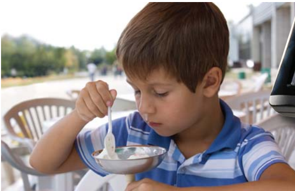
Quick Service Restaurants / Ice Cream Parlors