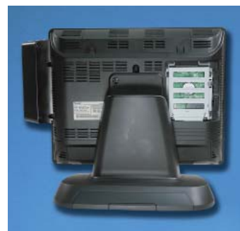
Tool-Free Access to Hard Disk Drive and RAM Optimizes Serviceability