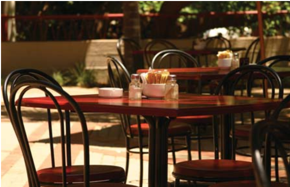
Table Service Restaurants