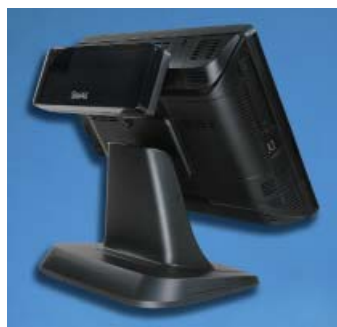
Optional Integrated VFD Customer Display