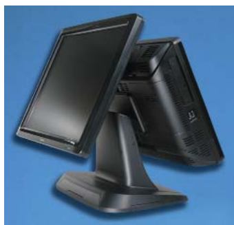
Optional Integrated 15" Rear LCD Customer Display