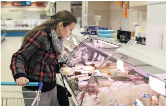
Grocery Stores / Convenience Stores