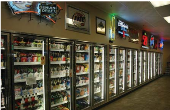
Retail Stores / Liquor Stores