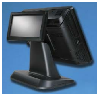
Optional Integrated 7" Rear LCD Customer Display