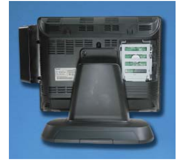
Tool-Free Access to Hard Disk Drive and RAM Optimizes Serviceability