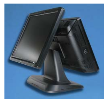
Optional Integrated 15" Rear LCD Customer Display