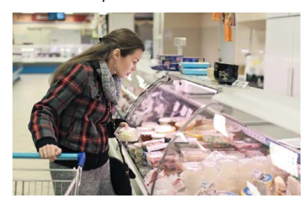
Grocery Stores / Convenience Stores