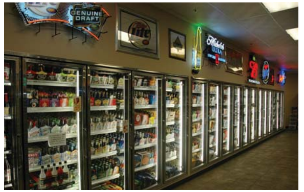
Retail Stores / Liquor Stores