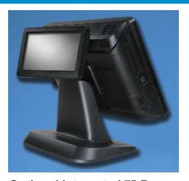
Optional Integrated 7" Rear LCD Customer Display