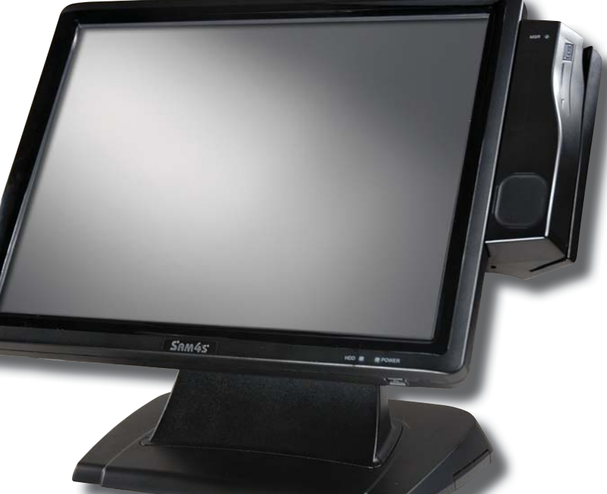
Table Service Restaurants