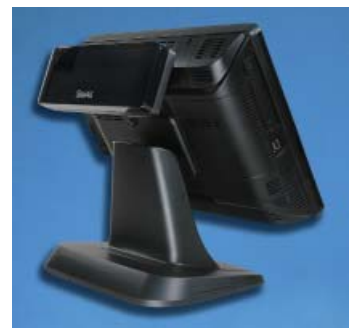
Optional Integrated VFD Customer Display