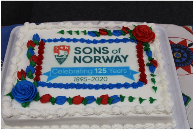
125 year Anniversary Cake!!