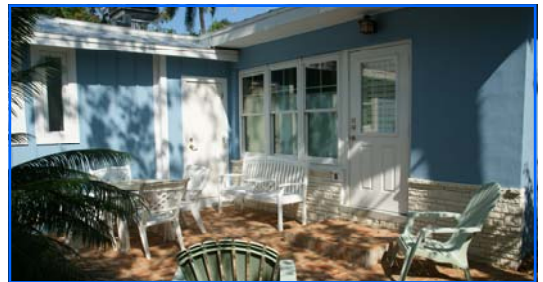
Above: 2 bedroom Main House with Guest House path on right through palm garden Center: Main House Gardenroom Porch and Main House living room Bottom: Guest House living room and Palm Garden front patio

Judy Bishop 239-682-6800 terrapalma@gmail.com