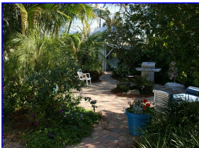
Above: The Cottage West, 1 bedroom apartment Center: The Cottage East, studio apartment Bottom left: 30' x 14' swimming pool with 30' x 10' lap lane - whirlpool tub beyond fence Bottom right: Butterfly garden and rear patio - also, Cottage West palm garden - ample paved parking