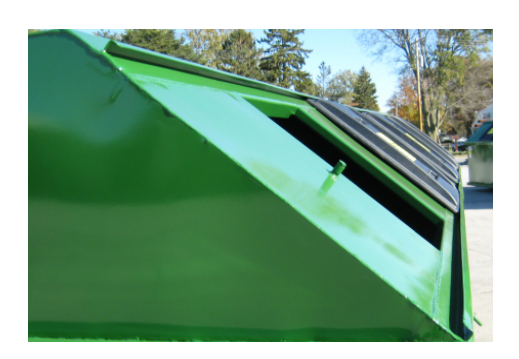
Door Stop and Track