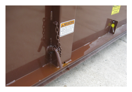
Outside Partition Retaining Pin