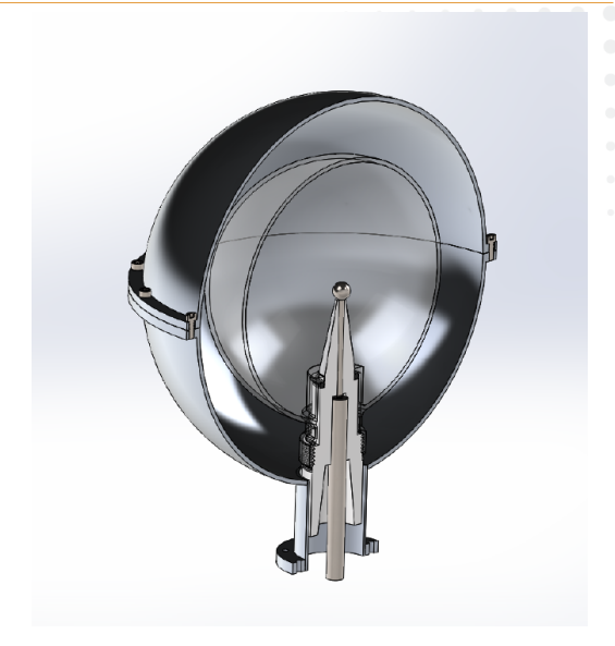
Cross-section of proposed prototype concentric AC velocity impact fusion reactor (ACVIF) with real target. To simplify, gas connections, insulation, and shields not shown.

High gain, simple, inexpensive, fast to develop structure.