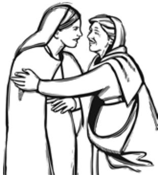
Mary Visits Elizabeth